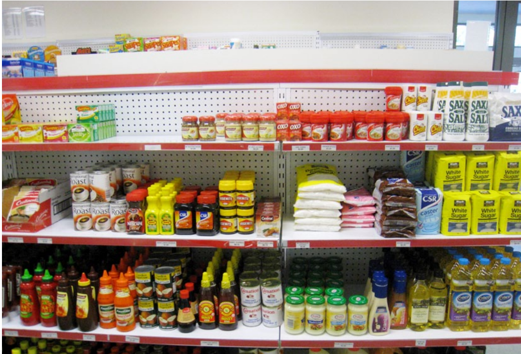
Items available in Boronia's canteen.