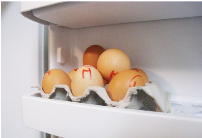
Eggs are an example of household purchase items, which are bought with household funds and divided amongst the residents of each house.