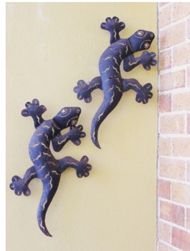
Boronia identifies the Kullaari gecko as a protector of Aboriginal women.