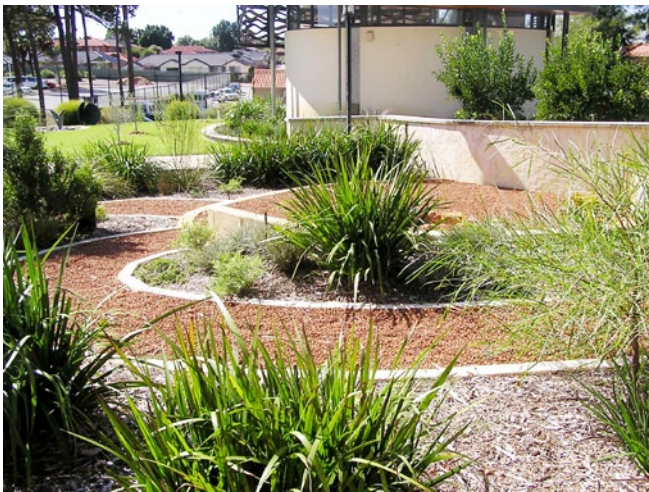
The First People's Garden – a meeting place for Aboriginal women.

Improve levels of engagement with Aboriginal institutions and agencies to implement in-reach and out-reach programs and activities and to raise the profile and recognition of Aboriginal culture at Boronia.