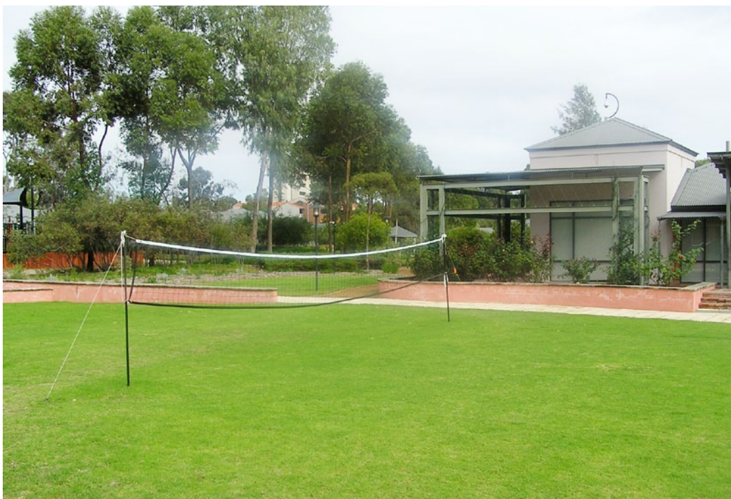
The central lawn area can be used for recreation purposes, including volleyball.