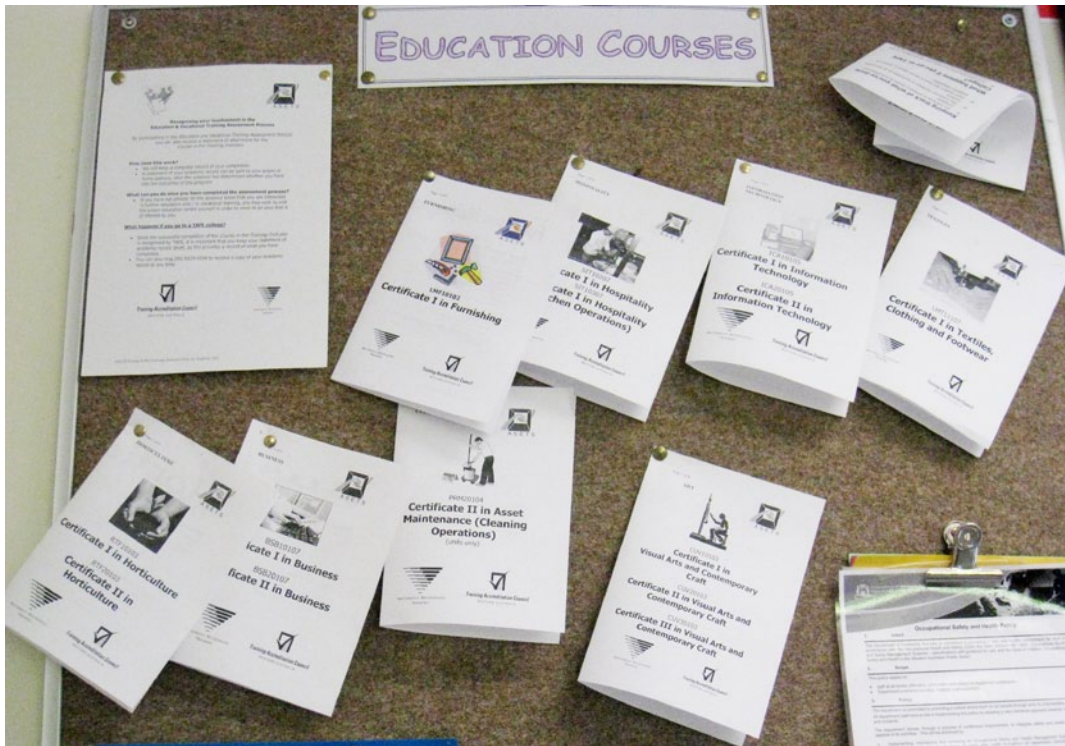
Boronia's education centre offers a range of education and training courses.