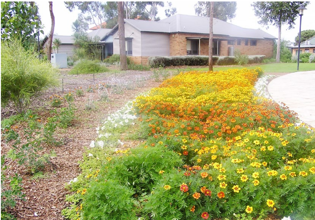
Garden beds at Boronia Pre-release Centre for Women.