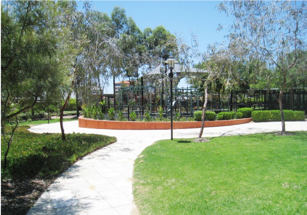
Boronia's grounds contribute to its unique atmosphere.