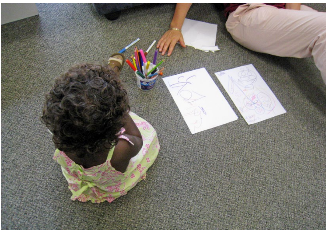
Boronia's women centred approach allows children up to the age of four to reside with their mothers.