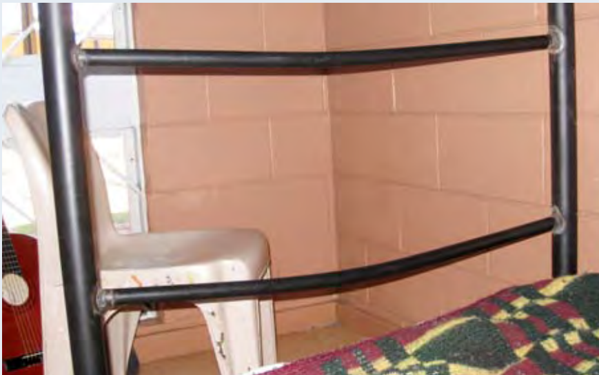
Welding that has been added to re-attach the rails on the end of the bed as they had broken away from the bed frame due to being used as a ladder to get up and down.