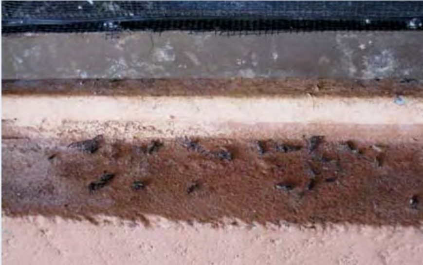
Evidence of rodent activity in the form of mouse droppings.