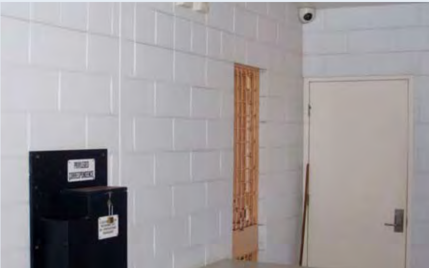
Confidential mail box located in the day room. Note the camera in the top right corner.