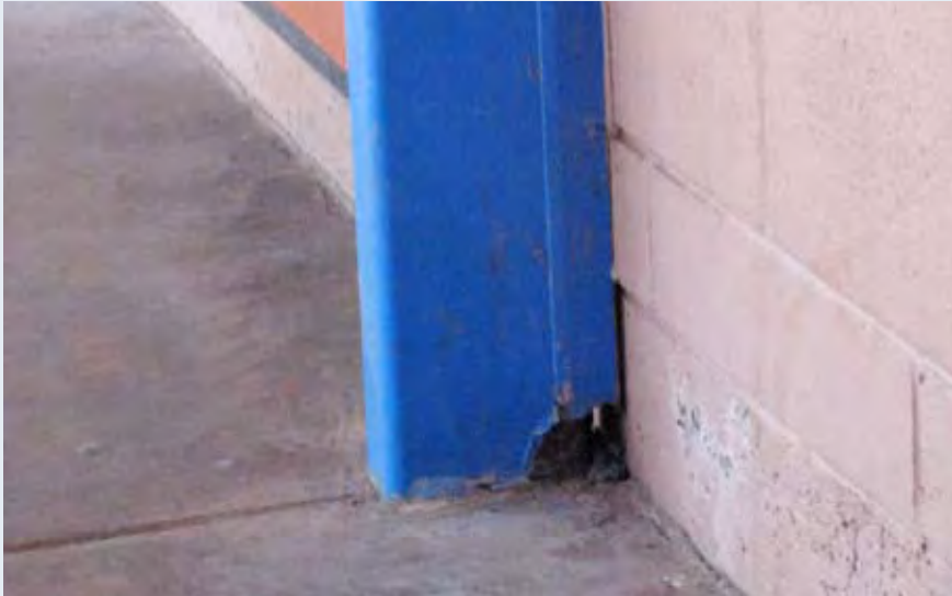
Rust hole in the bottom of a steel support. This support was deteriorating from the inside out.