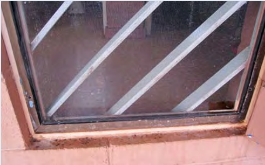
A hole in a flyscreen of a cell and mouse droppings outside on the window ledge.