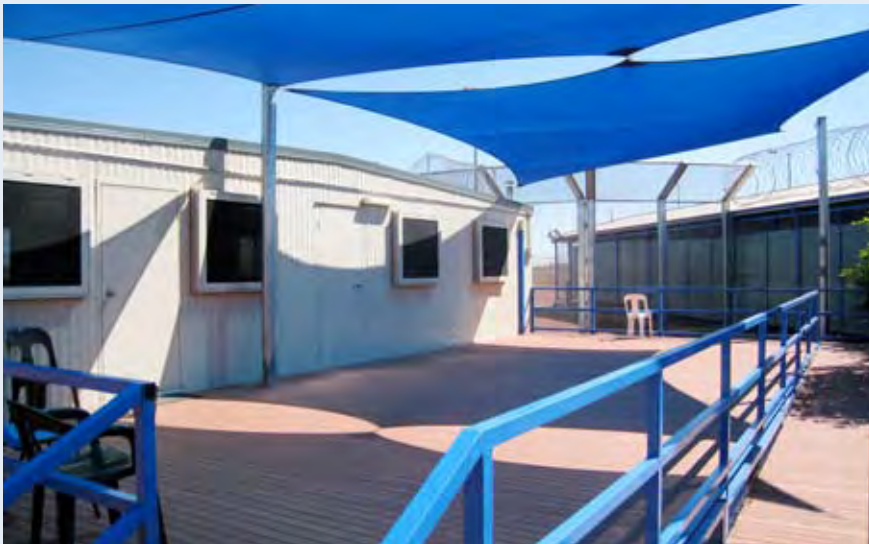
New female recreation / program building and veranda space.