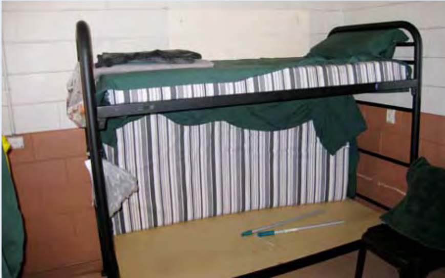
Photo of a typical bunk bed utilised at Roebourne Regional Prison. Note that there is no ladder to get to the top bunk and no rail to prevent persons from rolling out of bed. In most cases prisoners use the railings at the end of the bed to climb up and down. Note also the sheet of wood over the slats on the bottom of the bed to support the mattress.