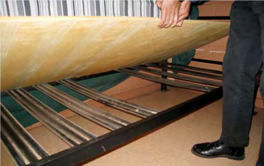
A sheet of wood covers the slats of the bed. Note the missing slats.