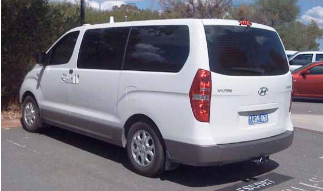
Figure 1: Hyundai iMax van customised for youth custodial transport