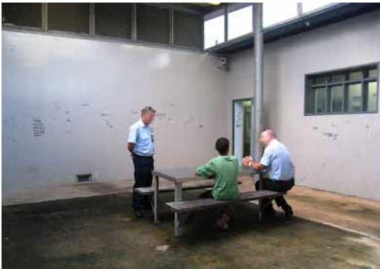
Figure 4: Youth custodial officers brief a youth about his journey to Perth in a regional police lockup

the escort party coming in off the plane. However, on occasions, some hours can elapse before the escort party arrives, and in the case of young people in Kununurra, the escort party has often had to arrive the night before. In these cases, YCS officers make a practice of visiting the young person at the lockup soon after arrival to introduce themselves and explain how the transfer will occur. They also visit the lockup prior to the young person's transfer to the airport to receive paperwork from the police.