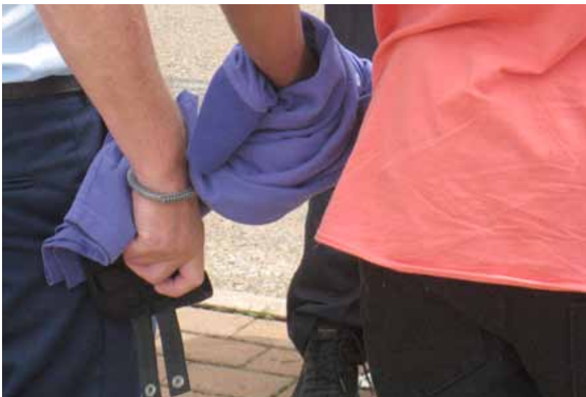
Figure 8: Hiding restraints in public at the airport