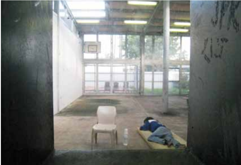
Figure 7: A young man in the yard at Kununurra police lockup

young people held in a police lockup. 27 Finally, it should be an open question whether alternative facilities are required and how such facilities should be staffed.