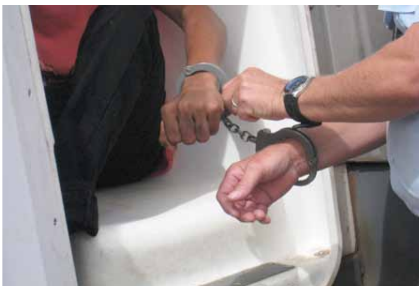
Figure 3: Youth transferred from police to YCS custody at regional airport