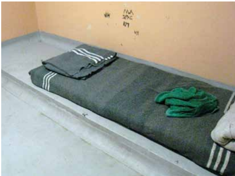
Figure 5: A youth used a blanket to cover his mattress in a police lockup