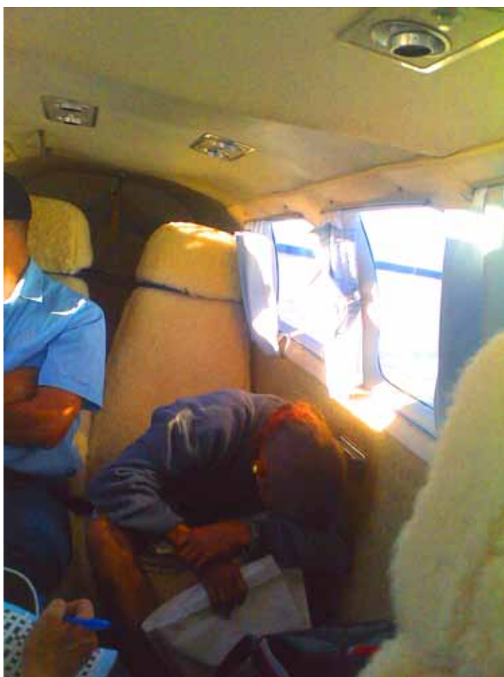
Figure 6: A youth feeling poorly on an air charter