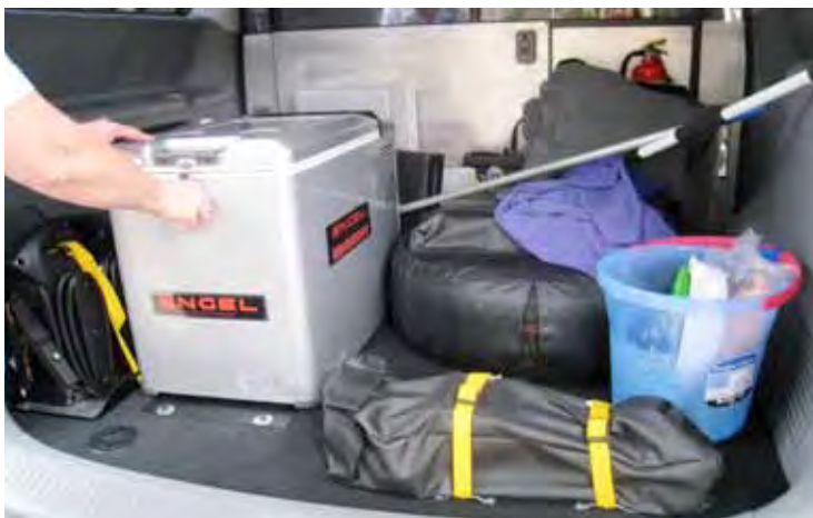
Figure 2: Refrigerated esky and equipment for security, safety and cleaning in iMax van