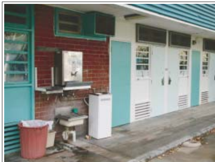
Day facilities were all located under the eaves, exposed to the weather.

5.3 In the Compound there were 50 cells fitted with bunks for two occupants, six single cells, and two dormitories – one with eight beds and one with four beds. Gross overcrowding in the Compound, where cells were originally built for single occupancy, was somewhat alleviated in August 2001 when the prison started