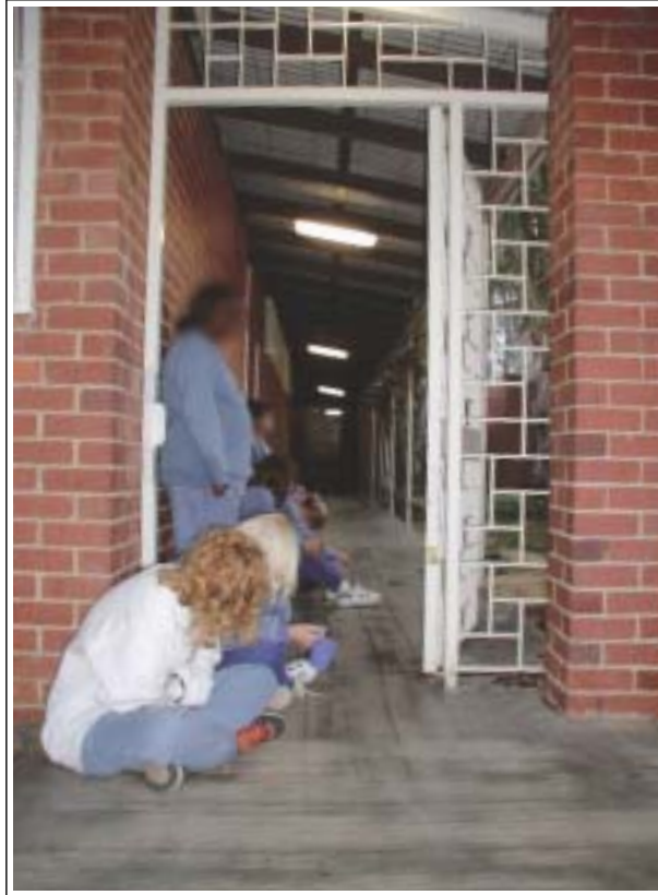
'They seem to treat us with no respect' – Prisoners waiting for their evening medication.

The majority (nine out of 16) of prisoner grievances in a 12-month period from June 2001 were about health services at Bandyup. They mostly concerned access and medical treatment. Three complaints regarding medication were made direct to the Office of Health Review in the three-month period from February to April 2002. Two were withdrawn or had lapsed, and one was unsubstantiated.