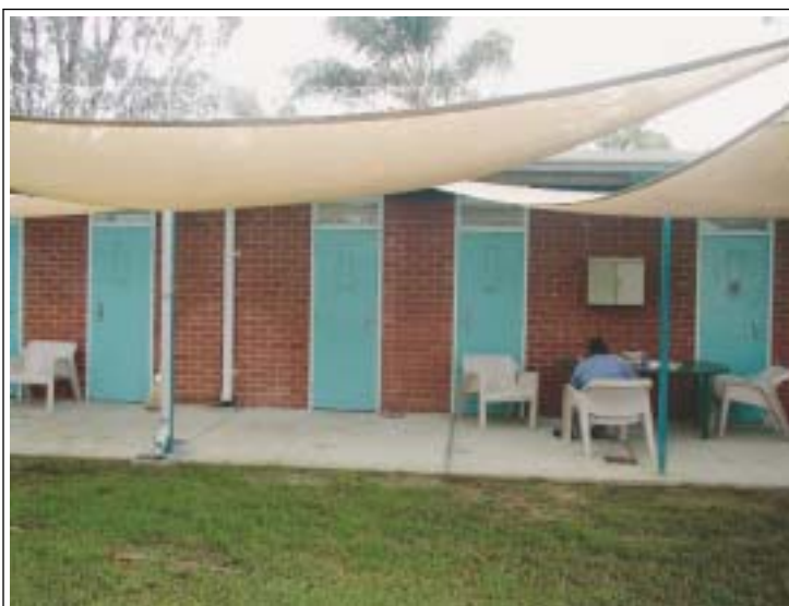
Generally, the prisoner in protection had human contact only at unlock, lunch-time and evening lock-up.

Prison Counselling Service would generally visit once a week. The recreation officer had reportedly visited once, and there was no formal contact with education staff. The prisoner was permitted an extra allocation of library books which she changed weekly. She had tried working in the textiles industries area but the arrangement had not worked. Her access to the telephone was ad hoc and the prisoner was dependent on staff being free to escort her to the Compound. She had an impending court appearance and her uncertain access to the telephone impacted on the prisoner's capacity to consult with her lawyer. The woman accessed visits with the rest of the prison population and on one occasion had apparently been seated next to the prisoner from whom she had sought protection.