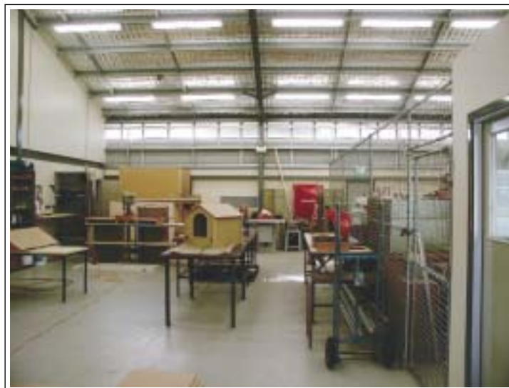
The woodwork shop with a kennel awaiting completion.

5.39 The metal shop functions essentially as a life-skills 65 workplace, with a focus on metalwork. It has a history of doing useful, consolidated work with prisoners, and both the prisoners and the instructor seemed really to enjoy what they were doing. The metal shop instructor teaches occupational health and safety to prisoners from all work locations. Prisoners are engaged in trade training that is functionally useful