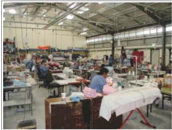
Sewing prison clothes.