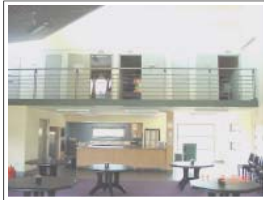
Prisoners preferred Unit 2 because there were showers in some cells and it was cleaner and less cramped.

7.4 The prisoners we surveyed were overwhelmingly in favour of being accommodated in the new unit rather than in the Compound, citing as reasons for their preference access to their own showers (prisoners in C and D wings only) and a cleaner, less cramped environment. Seventy-eight per cent of prisoners who had shifted from the Compound to the new unit felt this way. Of those surveyed prisoners who were currently in the Compound and had been previously, half thought the Compound was preferable, and half wanted to move to the new unit as soon as space became available. Prisoners who preferred the Compound said it was because they could open the windows, there were fewer prisoners to contend with, and there was more personal space.