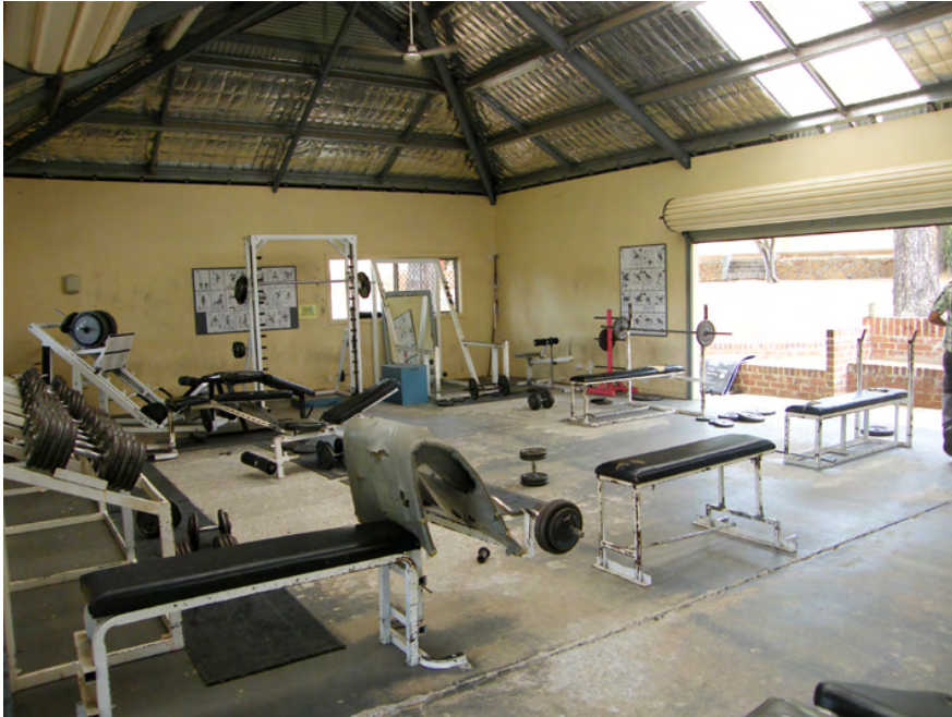
Equipment in the main gymnasium wears out quickly because of high usage.