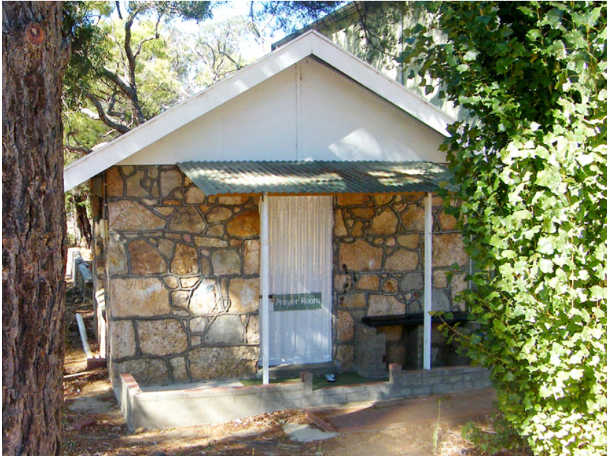
The exterior of the prayer room.