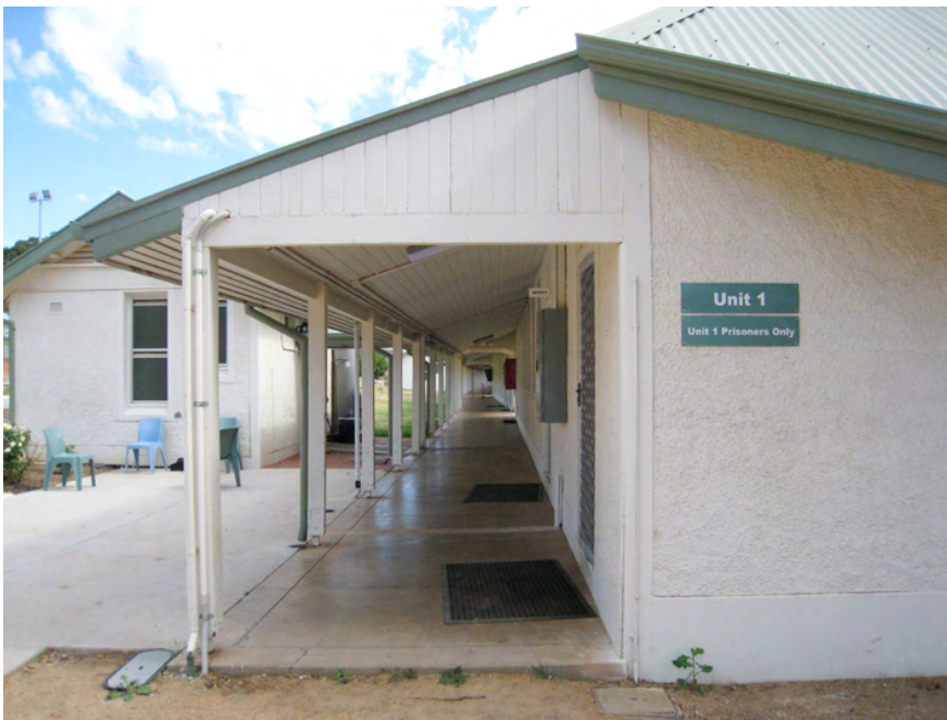
Unit 1 was opened in 2010 and has a capacity of 63 prisoners.