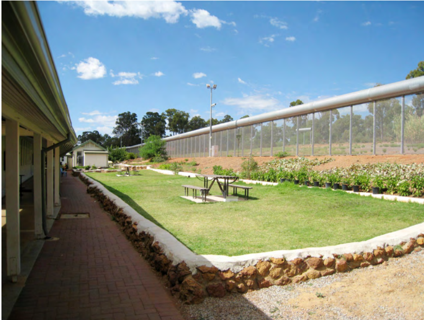
An outdoor area in Unit 1 with the prison's perimeter fence in the background.