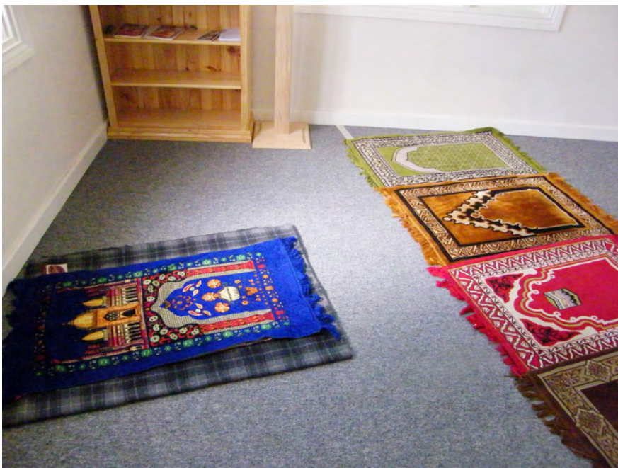
The interior of the prayer room set up for an Islamic prayer session. A maximum of four prisoners can be accommodated at any one time.