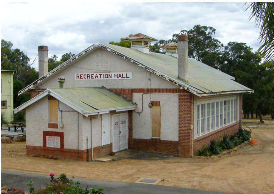
The heritage-listed Recreation Hall is in poor repair and cannot be used because the damaged ceiling presents a safety risk.