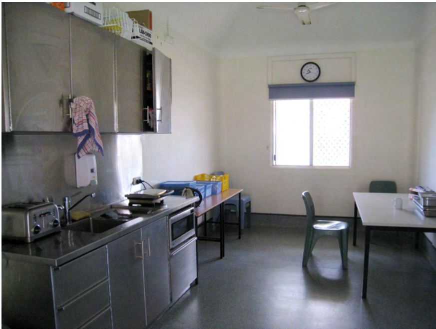
One of the kitchenette and dining rooms in Unit 1. There are nine dining rooms in unit 1, each catering to six or seven prisoners.