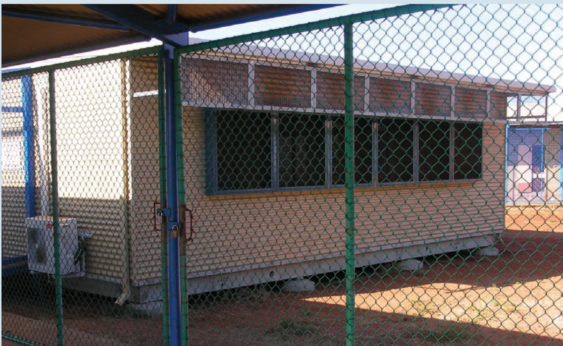
Offender services donga – space for programs, PCS and PSO.