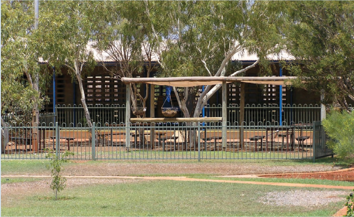
In response to recommendations made during the last inspection, the Department erected shading to cover the outdoor visits area.