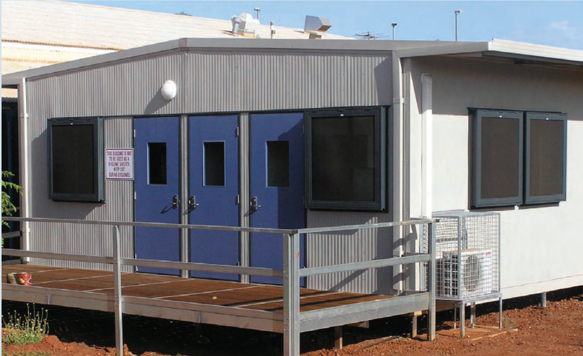
Education donga. Since the last inspection a number of donga style facilities had been added.