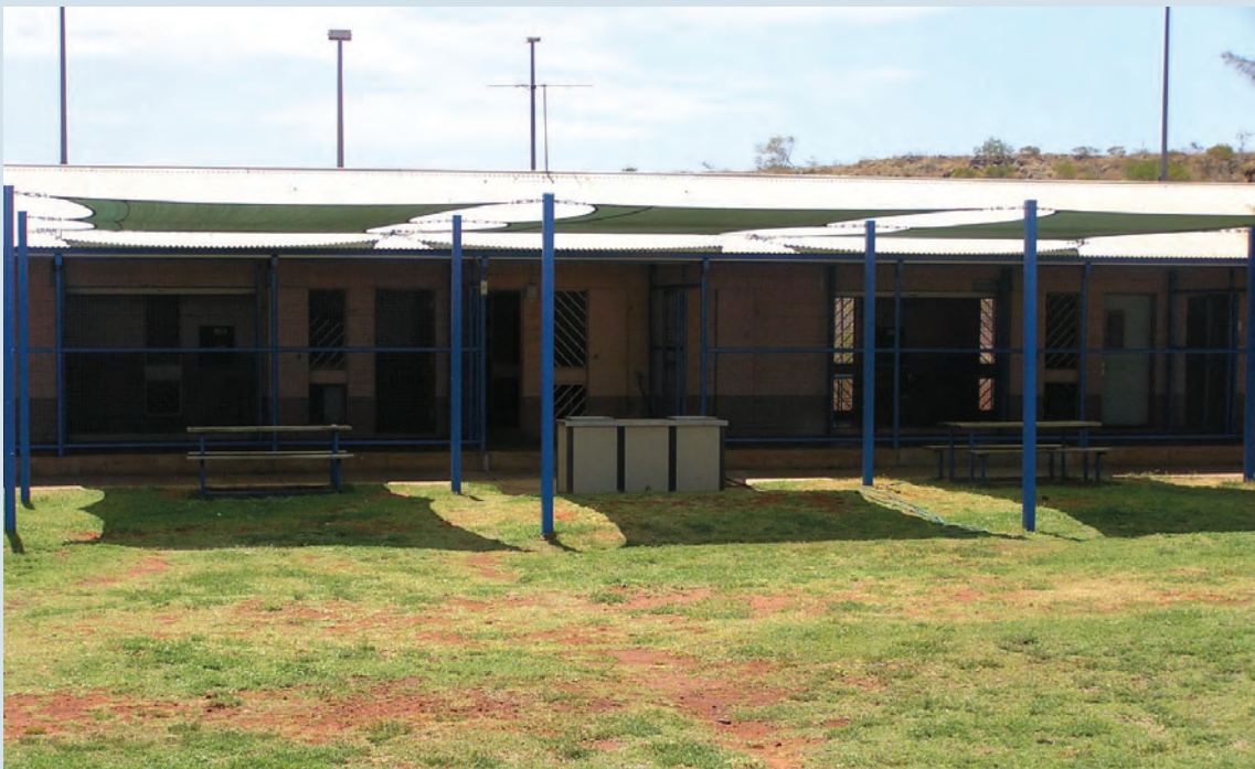
At this inspection the shaded area was completed. Note the removal of rocks placed for seating and the opening up of the two day rooms adjacent to the barbeque area.