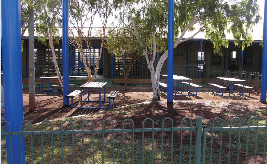
The addition of shading has proven effective, though as seen in this photo, the shading did not extend to the existing seating area.