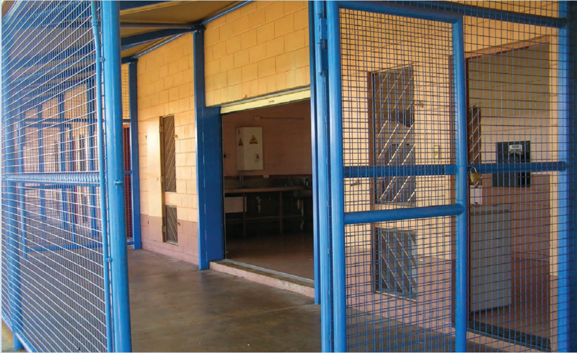
In opening up the day rooms in the minimum-security unit the Department inexplicitly and at considerable cost, enclosed the area with security fencing.