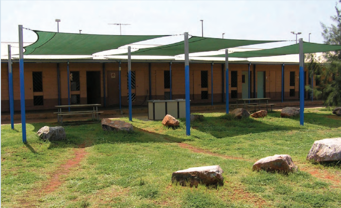
The shading to the barbeque area of the minimum-security male unit was still under construction for the November 2006 inspection.