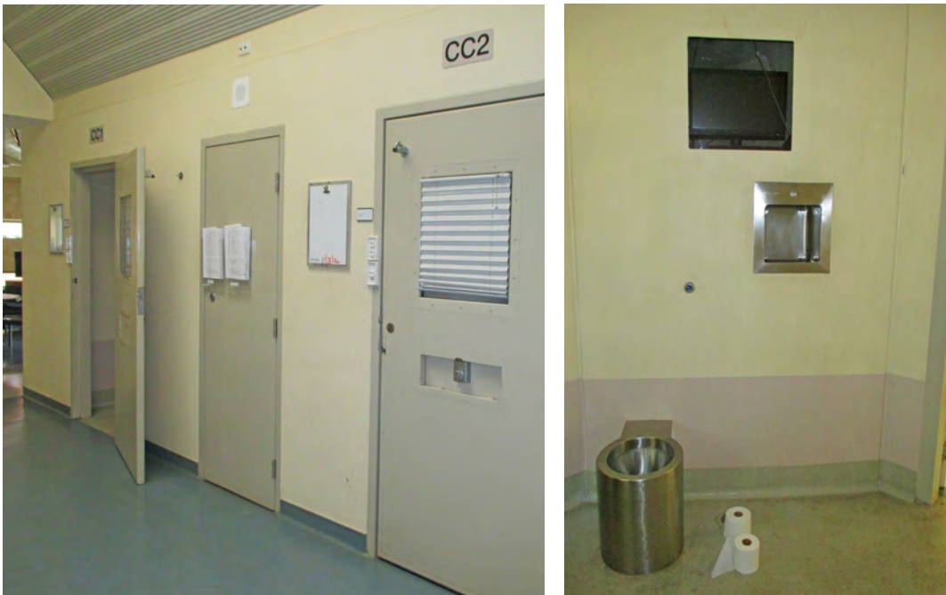
Crisis Care Unit: cell door and interior

10.37 The CCU is a six-bed wing for women in crisis and at risk of self-harm. However, it is also used to accommodate women with acute mental illness, a purpose for which it is entirely unsuitable. The individual cells are sparsely furnished, and medication is given through a hatch in the door. There is a communal day room and outdoor area but this is not secure, and women had been able to access a roof from the courtyard.