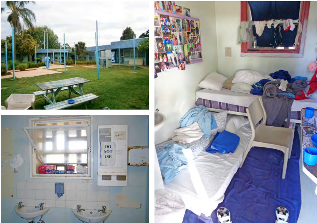
Unit 1: Outdoor area, communal bathroom and doubled-up cell

3.12 The cells, built only for single occupancy, include a stand-alone toilet. Due to their restricted size, the women who sleep on the floor have their mattresses alongside the toilet with their head beside it. During the nightly 12-hour lockdowns the women have no provision for their privacy or personal dignity.