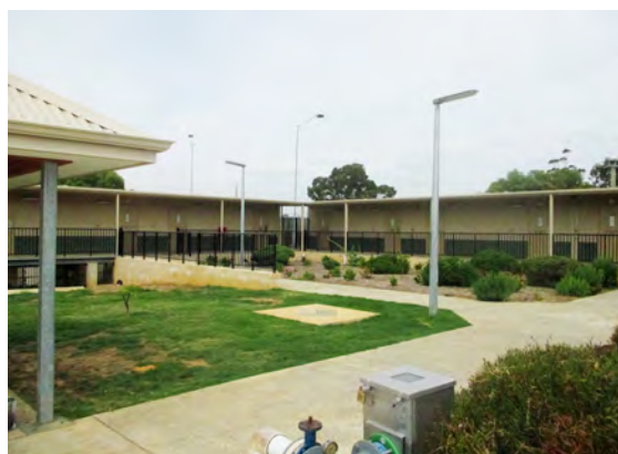
Unit 6: Shared cell and outdoor area