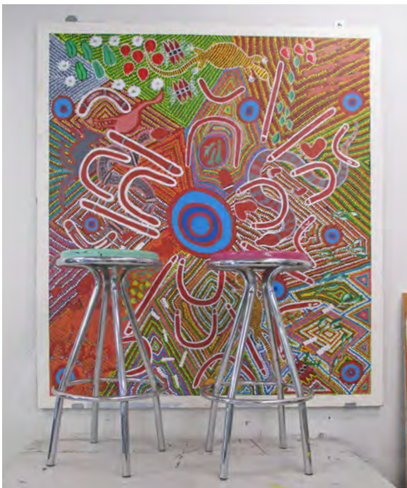
A prisoner's artwork