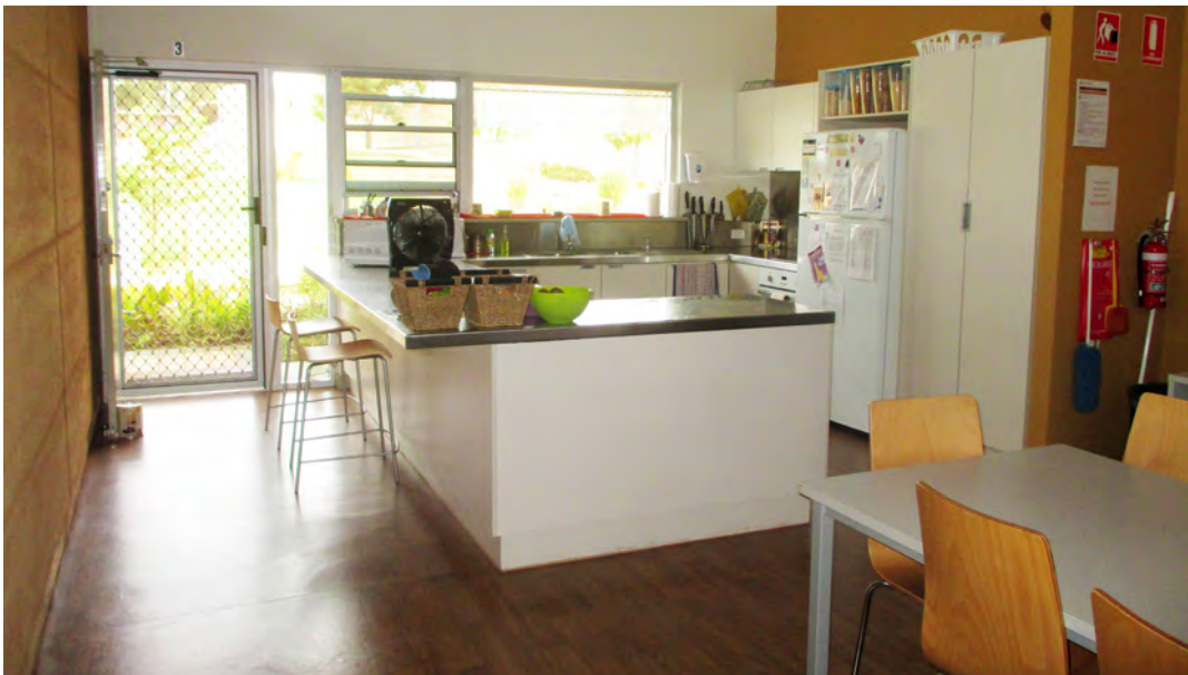
Unit 5: View across the grounds and shared self-care kitchen