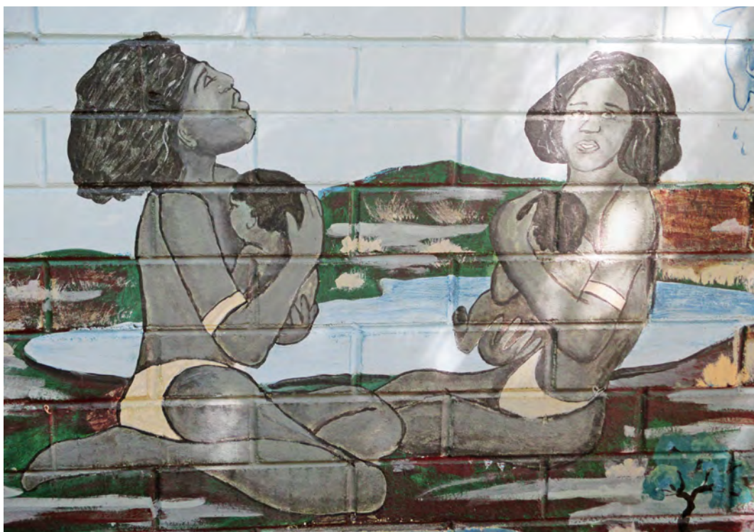
Section of a mural at Bandyup

Update Policy Directive 10 to provide: (a) more flexible transfer criteria for pregnant women in regional prisons so that they are not routinely moved to Bandyup at 20 weeks and that transfers are based on individual risk assessment; and (b) enhanced opportunities for children to have overnight or day-stays with their mothers or other carers in Bandyup, subject to appropriate risk assessments.