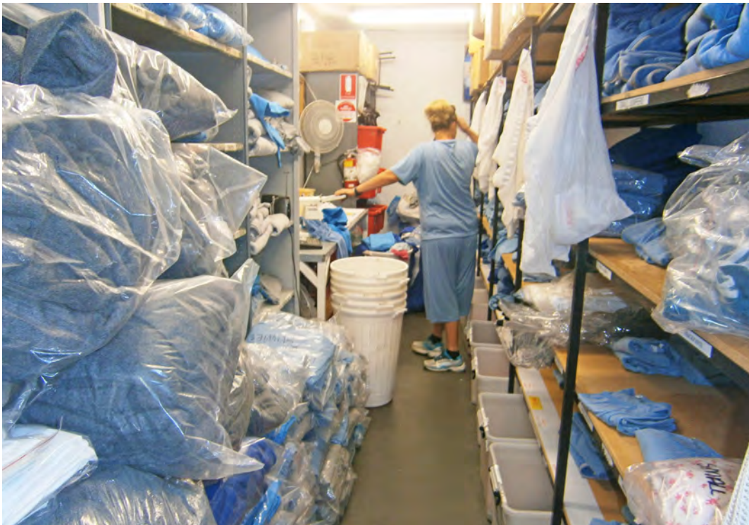
This and following page: Lack of space for prison industries has resulted in crowded work areas and a lack of appropriate storage

Bandyup management should continue to explore improved employment opportunities and, given the lack of investment in women's imprisonment over recent years, the Department should prioritise Bandyup's needs.