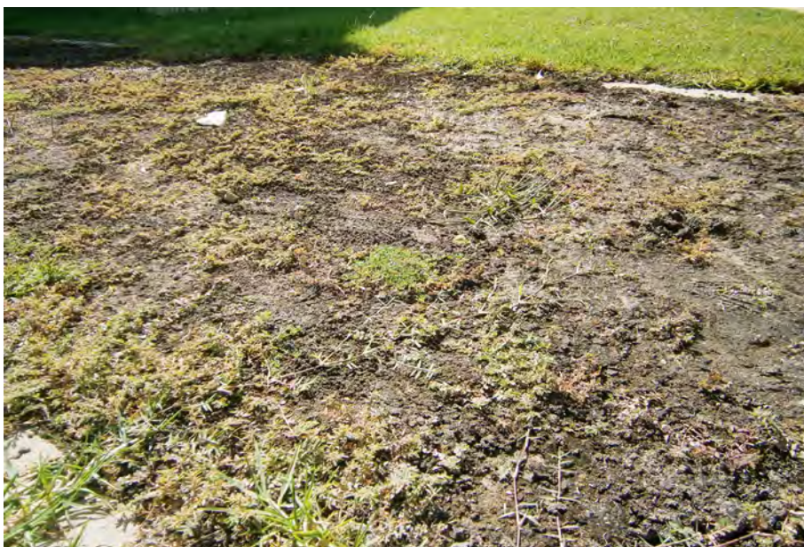
Outdoor recreation area and close up of the poorly kept running track