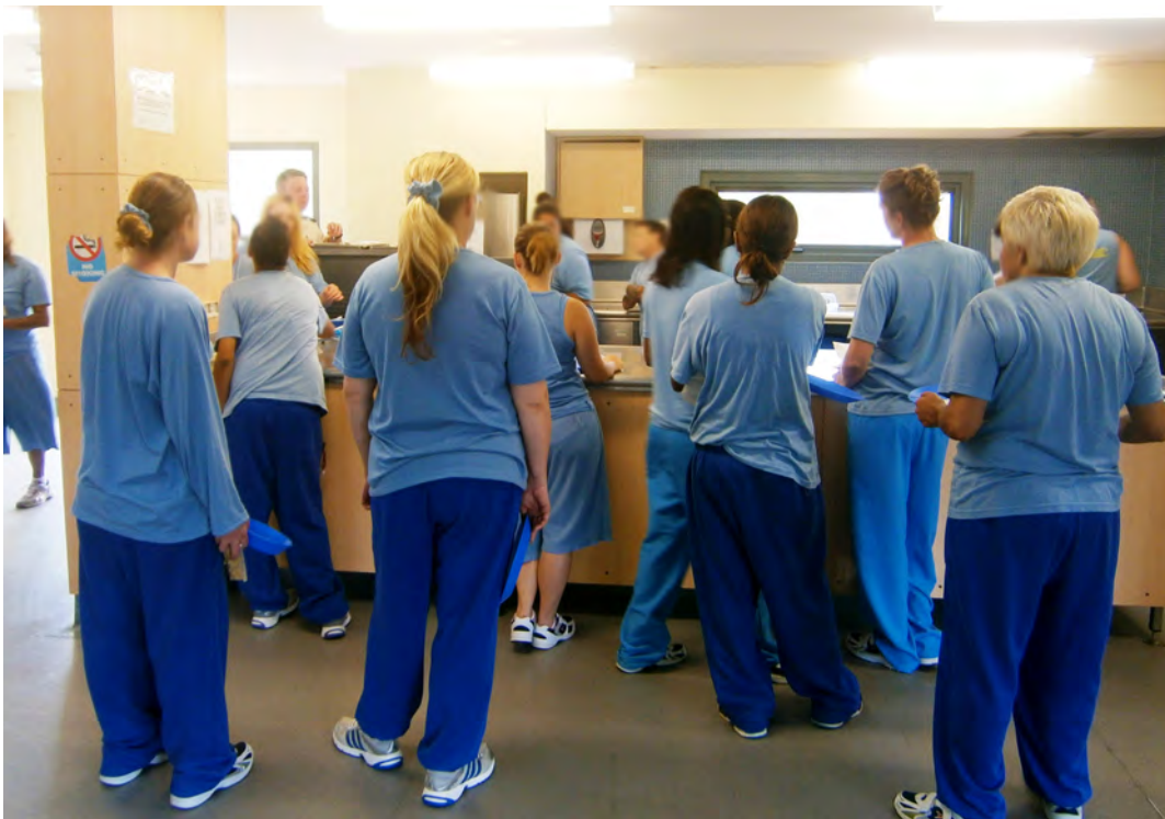
Lunch time dish-up in Unit 2