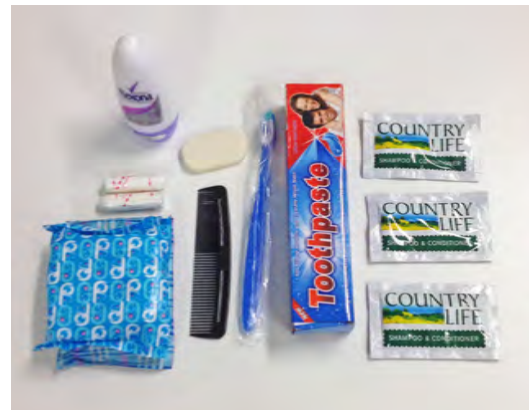
Orientation kit list and toiletries