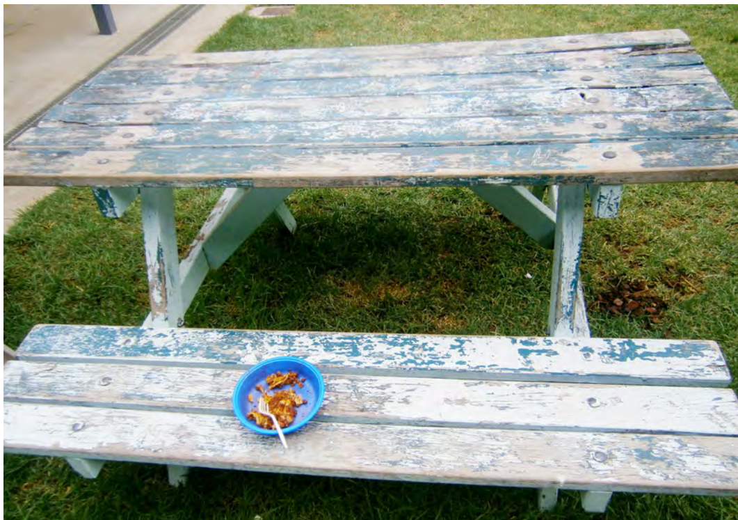
Unit 1: Aged and poorly maintained outdoor furniture