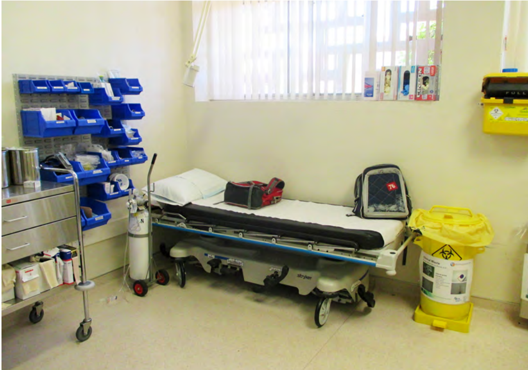
Equipment in the health centre