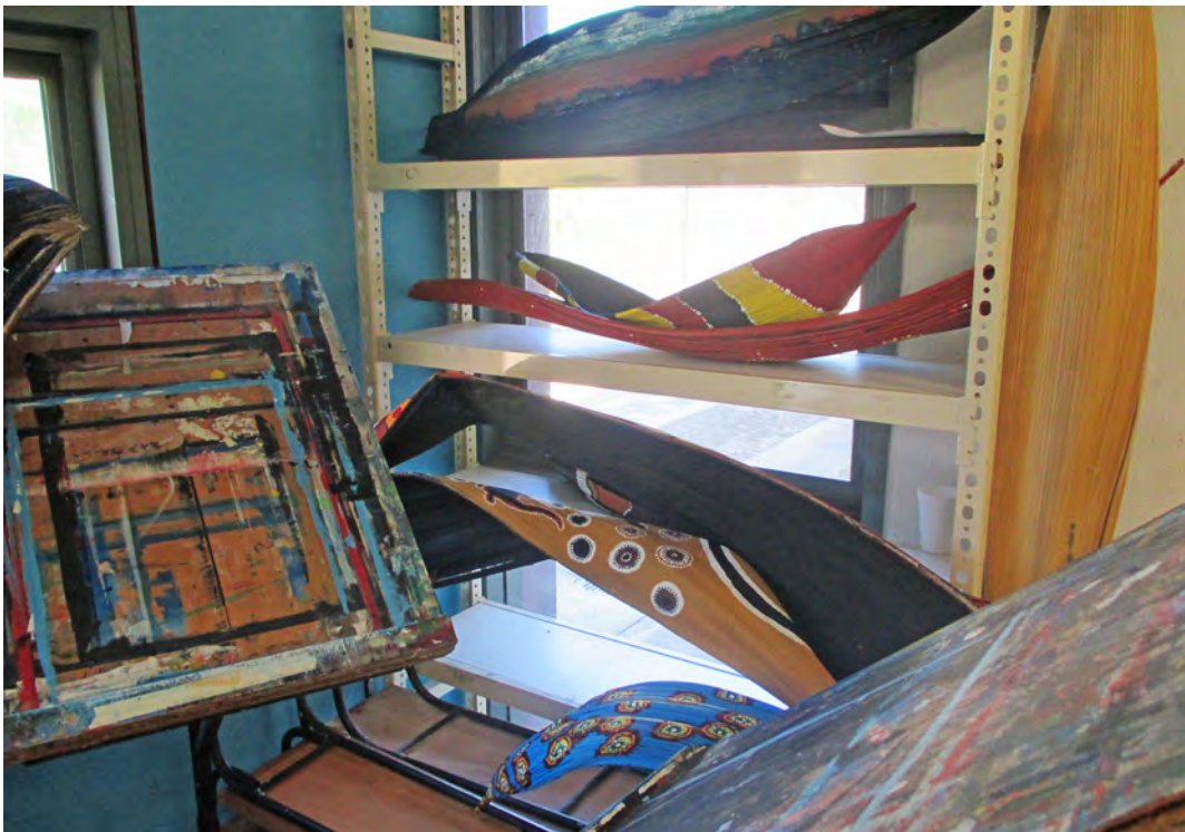
Work and materials from the Ruah 'Yarning Sessions'