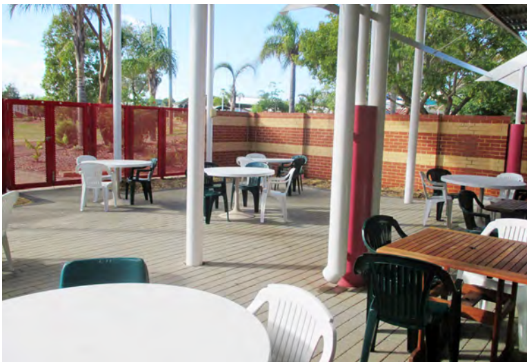
Visits area at Wandoo Reintegration Facility