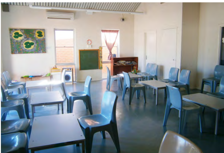
Visits area at Bandyup Women's Prison