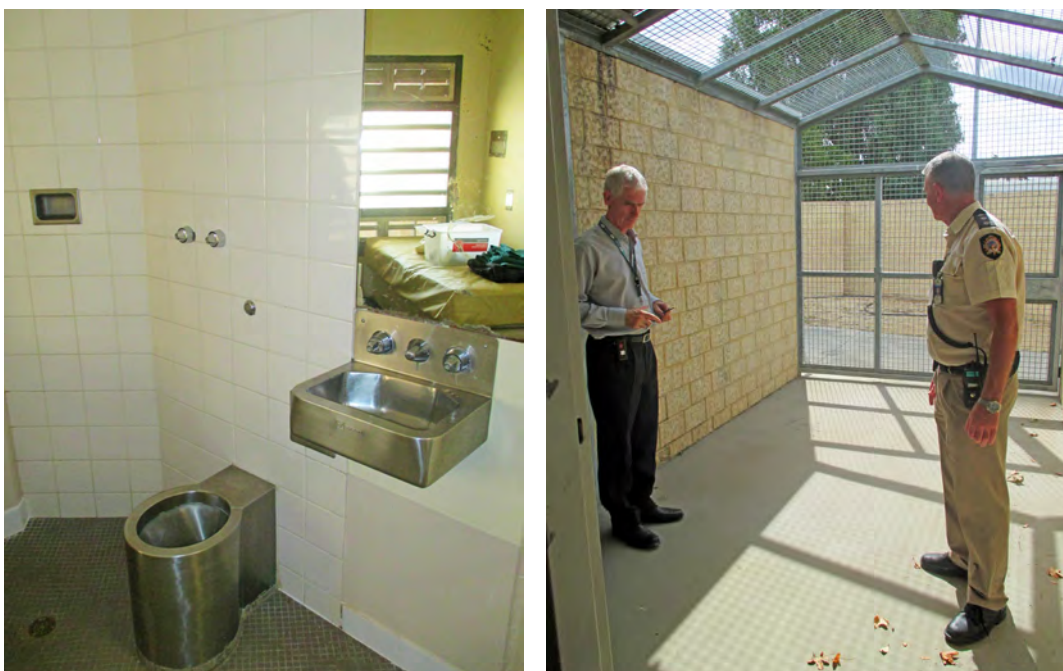
The Management Unit: cell interior and 'exercise yard'