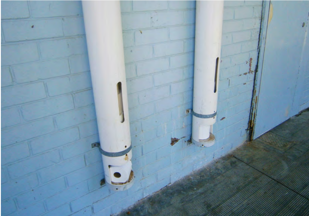
Unit 1: Toilet-roll dispensers in the yard