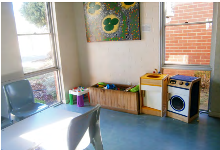
Play area for children at Bandyup Women's Prison