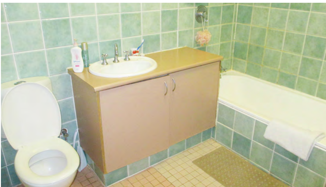
Unit 7: Shared cell and shared bathroom