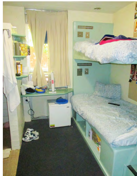
Unit 4: Doubled-up self-care cell