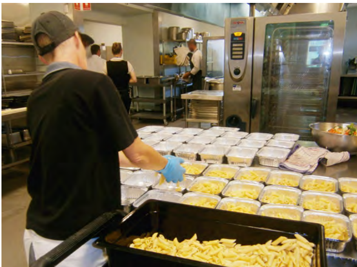
A prisoner prepares single portion meals