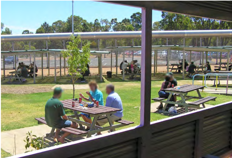
Visits area at Karnet Prison Farm