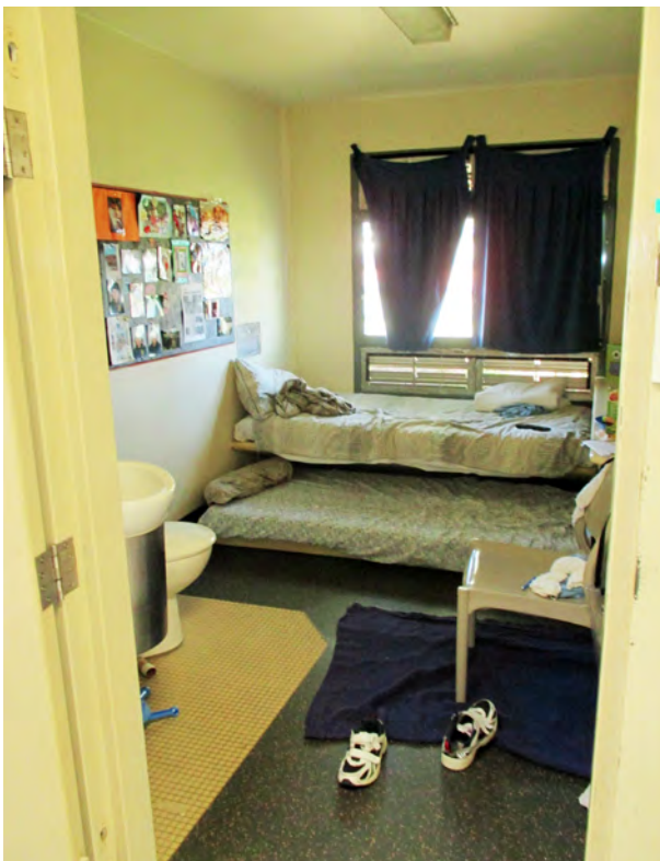
Unit 2: Wing corridor and doubled-up cell