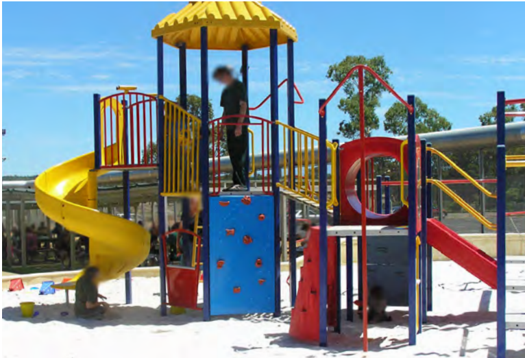
Play facilities for children at Karnet Prison Farm