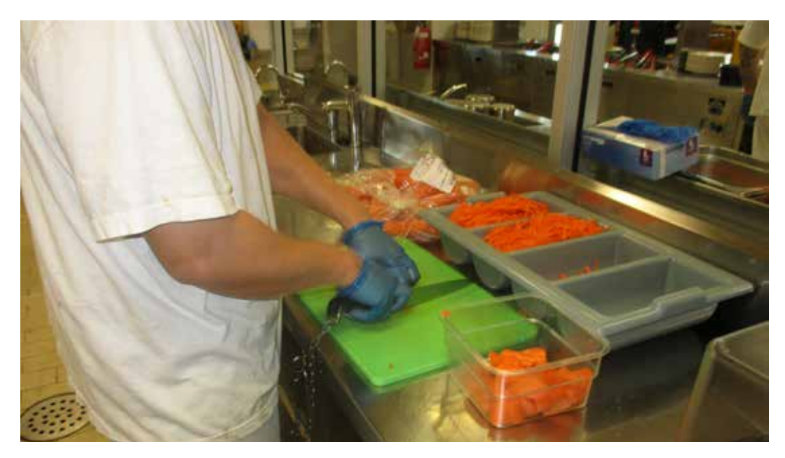
Figure 7: Trainee kitchen workers preparing meals.