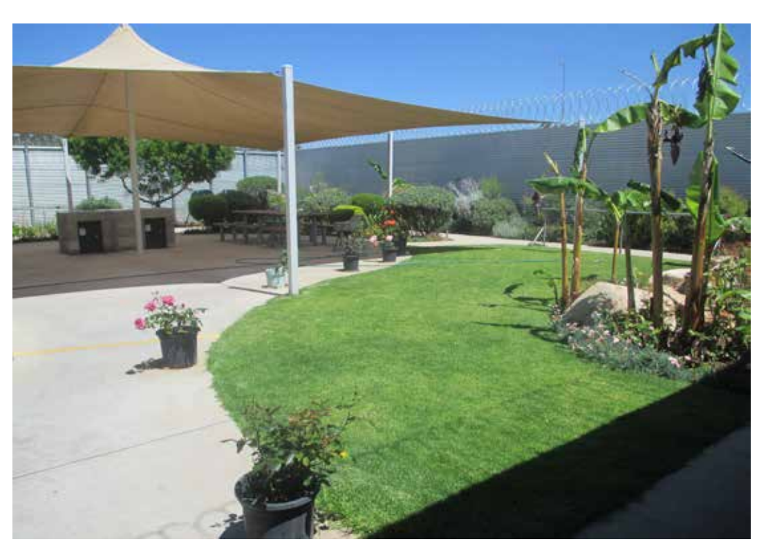
Figure 5: The garden in the Assisted Care Unit

been housed in the unit. The unit had an open feel to it, the cells were large, and there was a tranquil garden area that residents could access throughout the day.