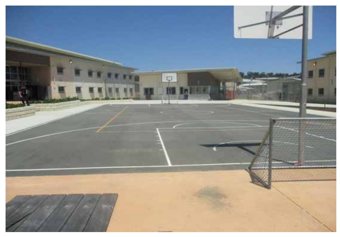
Figure 4: Young Adults' Community