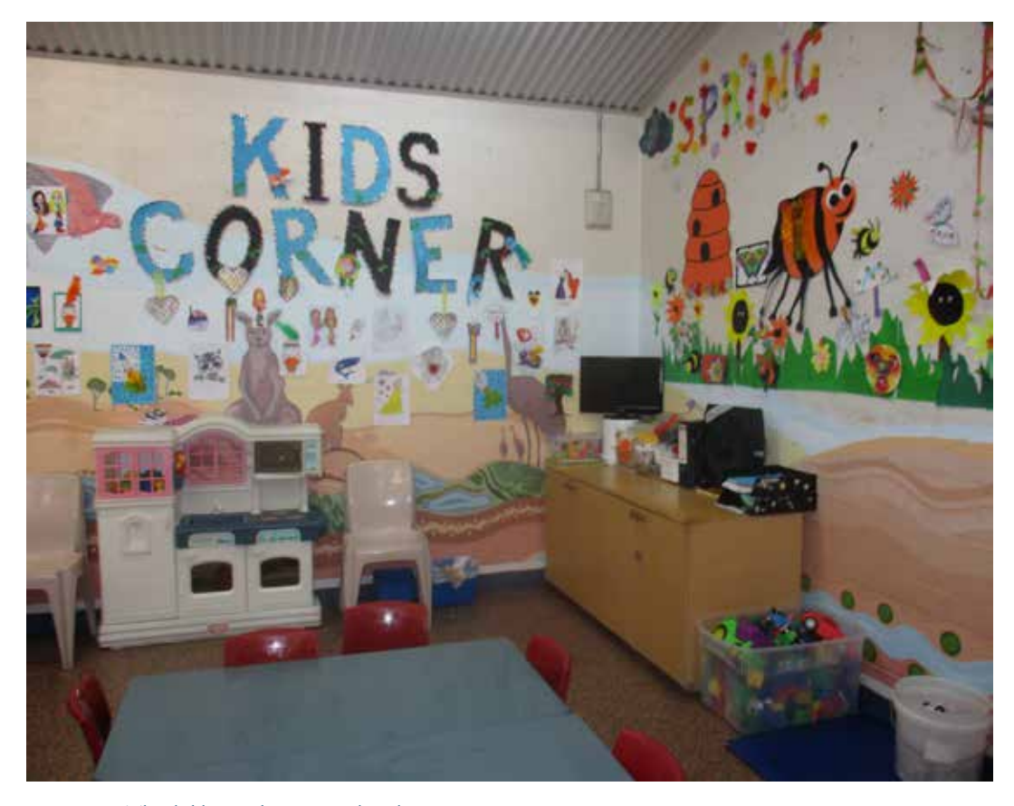
Figure 10: The children's play area within the visits centre

4.27 Prisoners are encouraged to maintain and develop relationships with family and friends through visits. Visitors call in advance and book their visits. When they arrive, they are processed through the visits reception area, which has a crèche and playground for children to use while they wait for the visit to commence. Just before the visit starts, visitors are screened through the gatehouse and ushered to the visits centre. Staff in all of these areas treated visitors in a professional, courteous, and efficient manner.