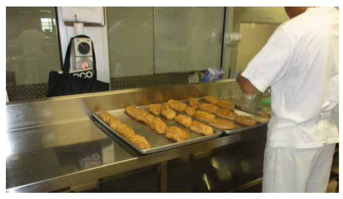
Figure 8: Trainee kitchen workers preparing meals.