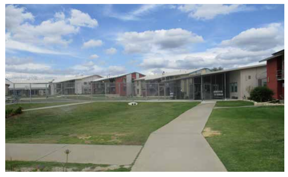
Figure 2: Self-care accommodation units