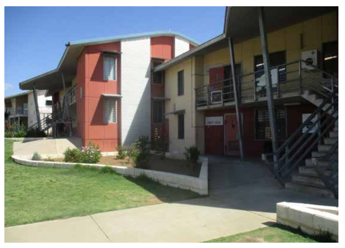
Figure 3: Self-care accommodation units

the expansion, the self-care block increased in size which led to a reconfiguration into two separate blocks: one side for lifers and the other for general self-care.