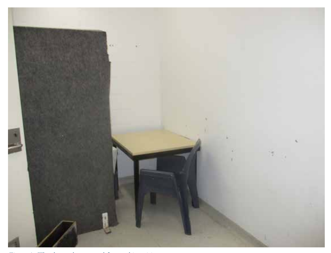
Figure 1: The cluttered room used for searching visitors

be used as a storage area and was cluttered with furniture. These items should be removed and stored elsewhere.