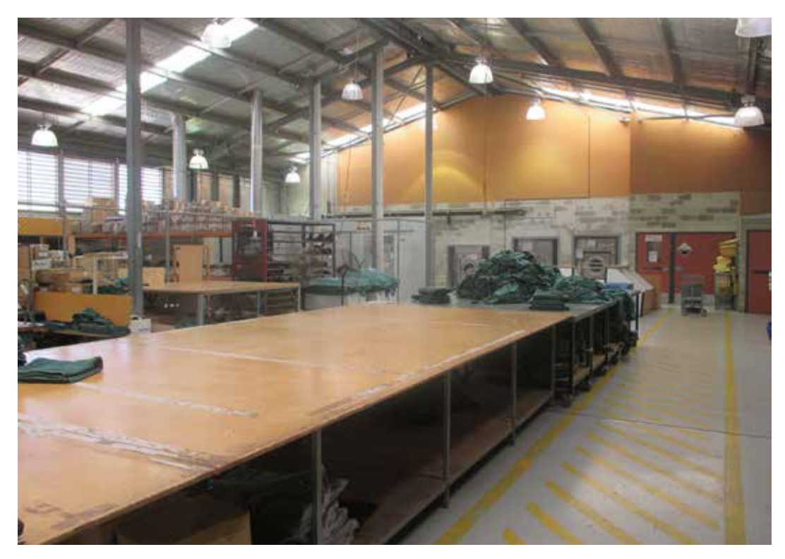
Figure 6: The laundry where linen is washed and exchanged.

Sixty-seven per cent of prisoner respondents to the pre-inspection survey rated laundry conditions and processes as good. The main prisoner complaint was about the quality of clothing. Laundry staff confirmed that some batches of prisoner clothing can be of poor quality, causing clothes to shrink in the wash or deteriorate. The shoes were also basic quality and many prisoners who could afford to resorted to buying their own shoes.