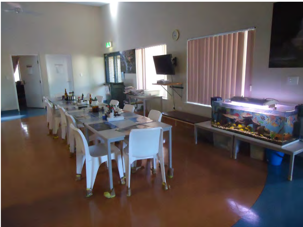
Figure 16: Common area in one of the four self-care wings in Unit 3.