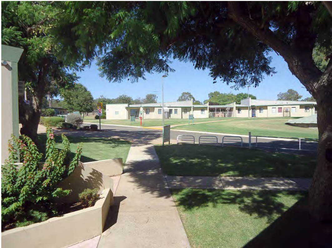
Figure 6 and 7: Well-cared for grounds at Karnet.