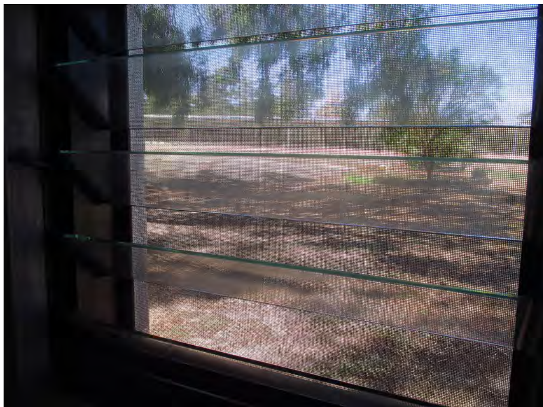
Figure 5: Lowered glass windows with fly screens installed at the end of corridors in the original wings of Unit 2, to improve ventilation.