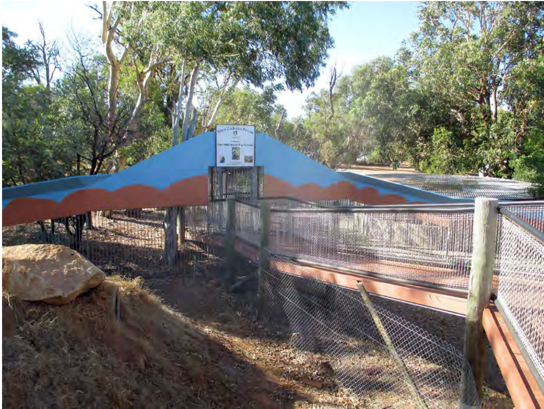
Figure 14: Large dingo enclosure at the Kaarakin Black Cockatoo Conservation Centre, located approximately 30 km south-east of Perth CBD. This was constructed by prisoners from Karnet, who have performed considerable productive work for Kaarakin over the years.