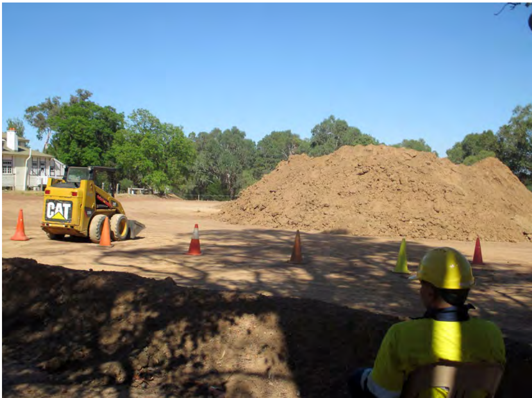
Figure 11: Training area, Fairbridge Bindjareb Project. The project is an excellent example of Aboriginal specific training.