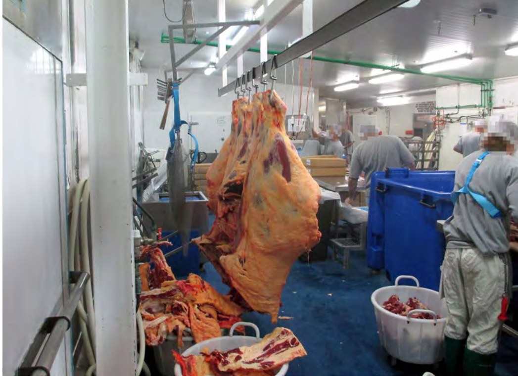
Figure 12: Prisoners working in the abattoir.