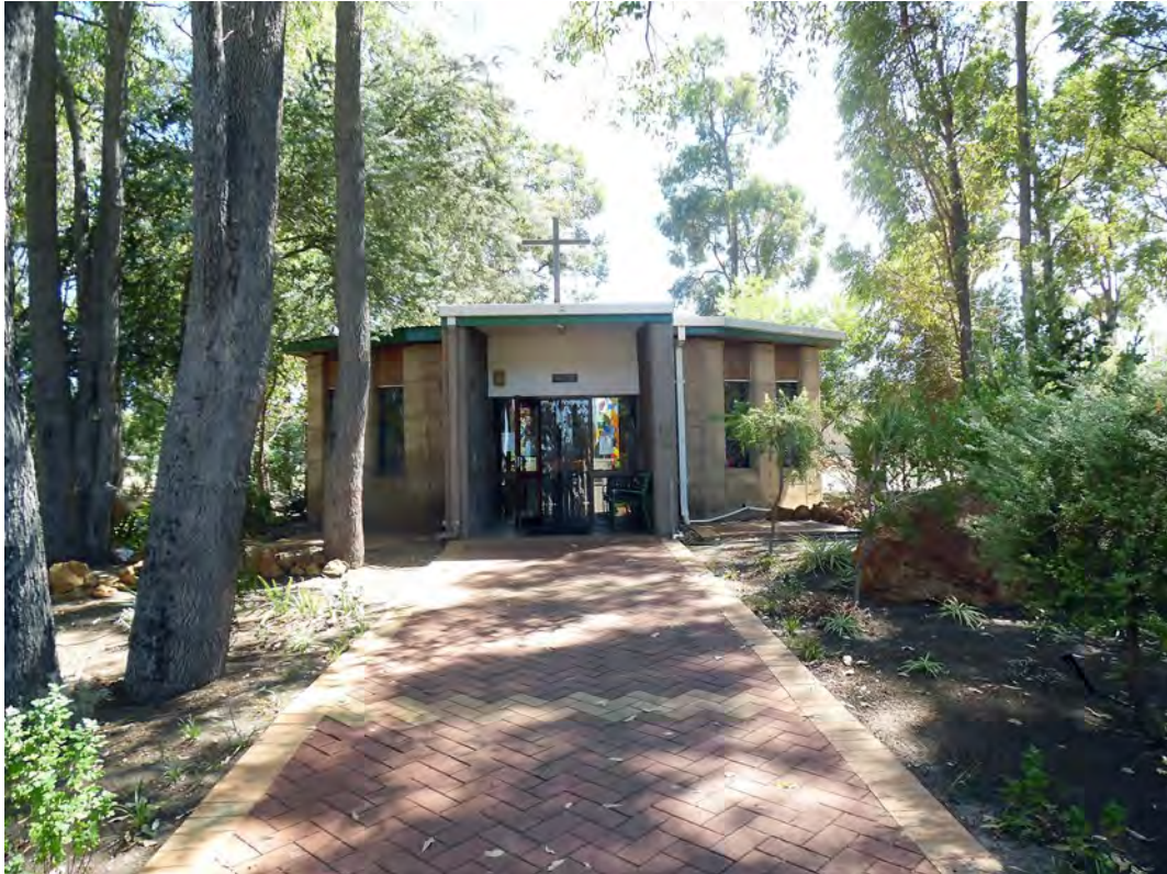
Figure 10: The Worship Centre at Karnet.

aesthetic and contemplative refuge from the prison proper. Karnet is well serviced by its coordinating chaplain, and five regular chaplains, including a Noongar elder from the Uniting Church. In addition, pastoral visitors conducted Bible study courses, meditation meetings, and prayer sessions.