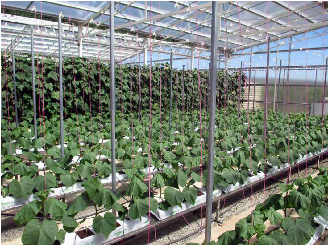
Figure 13: Fresh produce growing in one of the hydroponic sheds. Horticulture is an avenue for skilled employment and vocational training at Karnet, as well as contributing fresh produce for consumption.