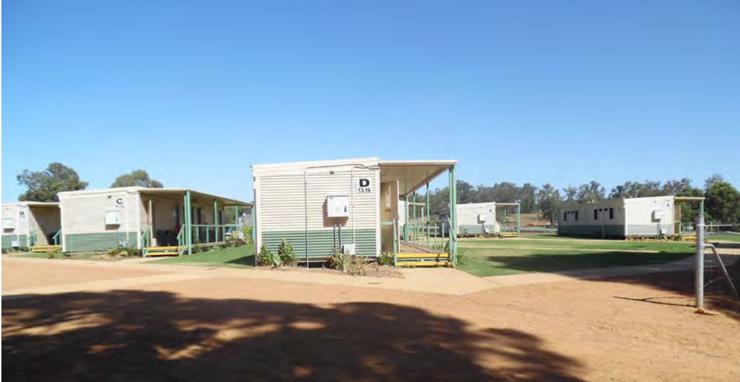
Figure 17: Accommodation blocks, Unit 4.