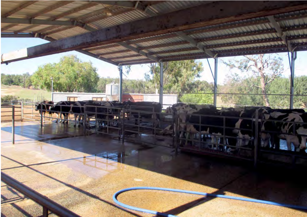
Figure 15: Karnet is the Department's principal producer of milk for internal consumption. Prisoners working in the dairy benefit from working in a role monitoring and ensuring animal welfare.

and/or delay of these projects (due to budget constraints), in conjunction with a rapidly increasing prisoner population, suggests it may be timely to at least revise and update this plan. Even more so if the recommended independent cost-benefit analysis of agricultural production at prisons is not pursued.