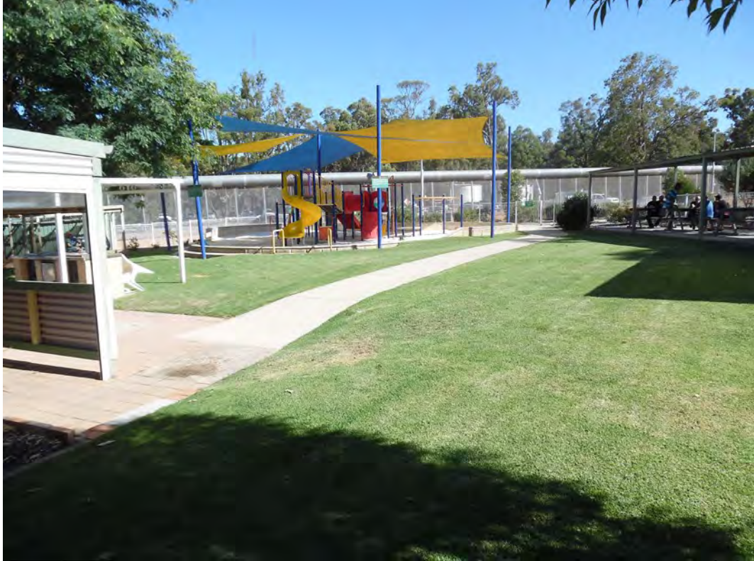
Figure 8: Outdoor area at the excellent visits centre, including children's play area.

the case during the 2013 inspection, which resulted in a recommendation from the Office. Used as a staff training centre through the week, on weekends it allows visitors a sheltered area to register and put money into prisoner's accounts when they arrive at the prison. Toilet facilities are also available nearby.