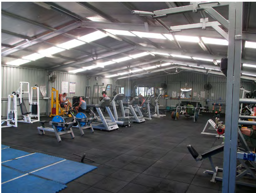
Figure 9: The well-equipped recreation centre.

both valuable, and conducive to community reintegration (OICS, 2010, p. 31). Provided prisoners undergo a proper risk assessment and there are suitable policies in place, this Office still supports all such initiatives.