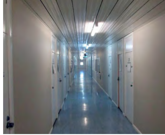
Figure 3: Double bunked cell accommodation, Unit 1. Figure 4: Wing corridor, Unit 2.