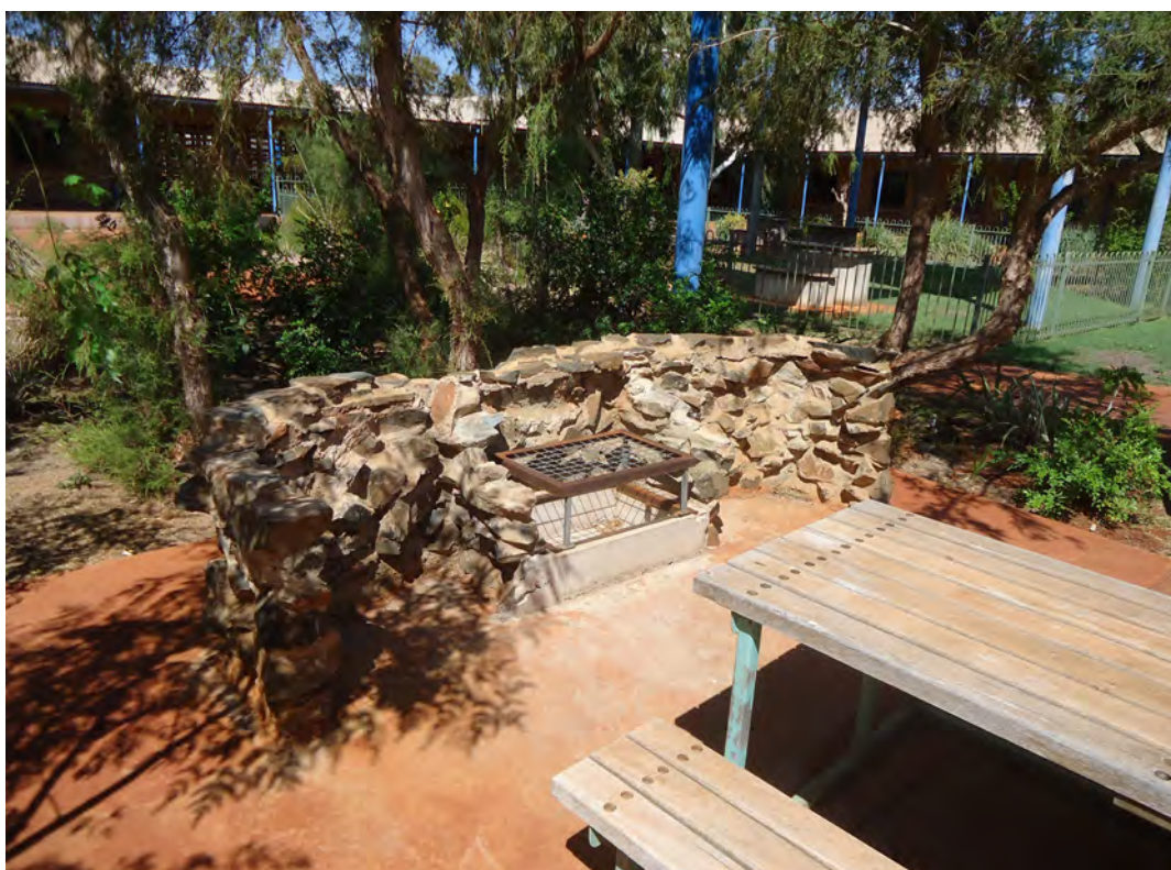
Figure 14: The Aboriginal meeting place.