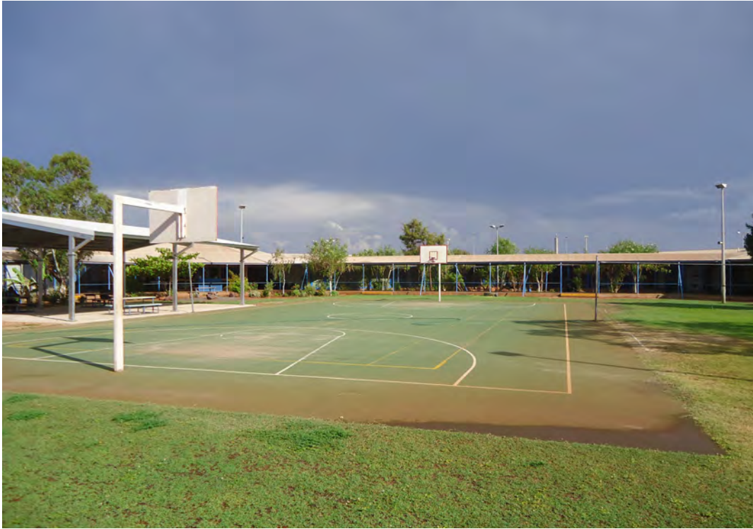
Figure 13: External recreation area

recreation: there is a basketball court, a grassed area available for volleyball games and a small shade structure with a limited amount of exercise equipment.