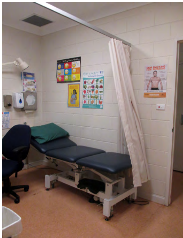
Figure 15: The health centre which is in need of refurbishment.

The health centre at Roebourne Regional Prison must be refurbished so that it is fit for purpose, and extended to meet current and future demand.