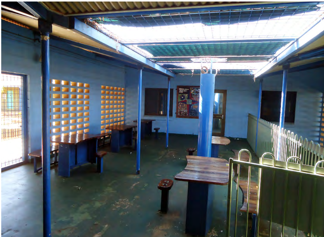
Figures 8, 9: The social visits centre – limited indoor space and poor facilities for children