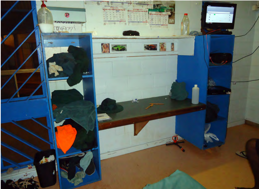
Figure 1: Cells were cluttered and lacked sufficient storage space