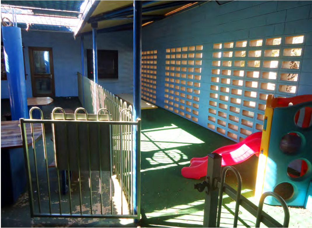
Figure 10: The social visits centre – limited indoor space and poor facilities for children