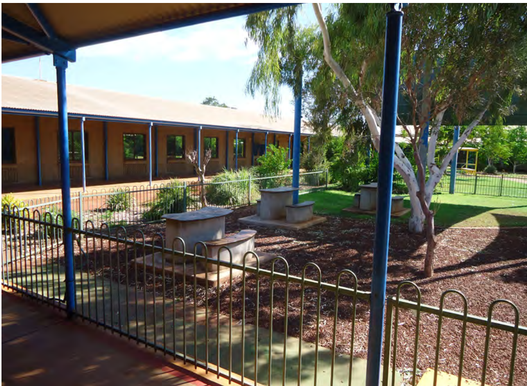
Figure 11: The outdoor visits area