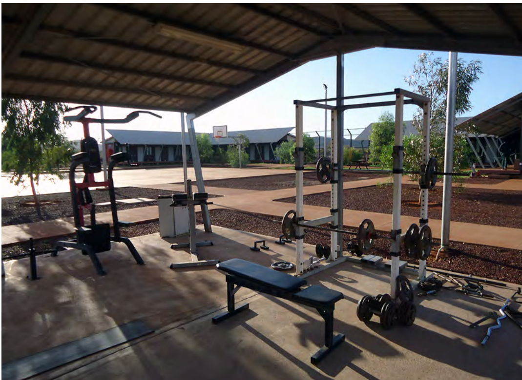
Figures 6, 7: The work camp