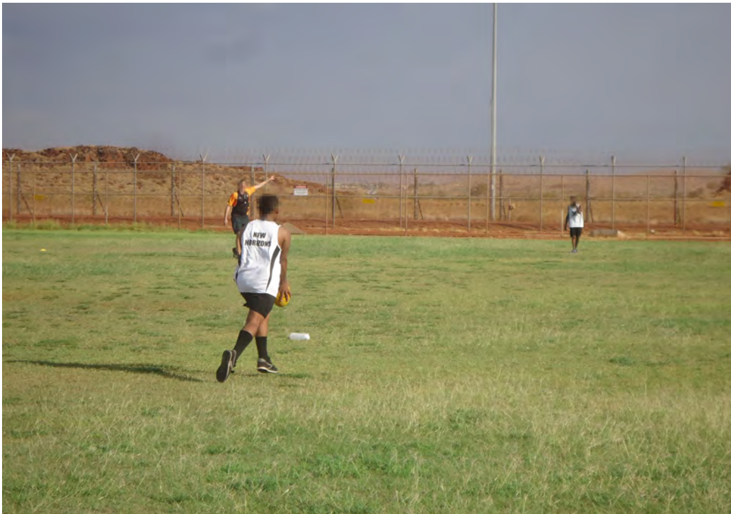
Figure 12: The V Swans program was still running at Roebourne but could only be facilitated from inside the prison

3.54 Pleasingly, the V Swans program was still running at Roebourne, albeit in a much more restricted form. At the time of the last inspection, prisoners involved in the V Swans program were participating in an offsite football program. The prisoners supplemented the local team in a regional competition ultimately helping the team win the premiership. However, due to a change in departmental policy borne out of the escape of a prisoner in 2014, prisoners now have very limited access to external recreation. The current on-site program runs for 24 weeks with intense physical training complemented by health and nutrition education. There are approximately 30 prisoners involved.