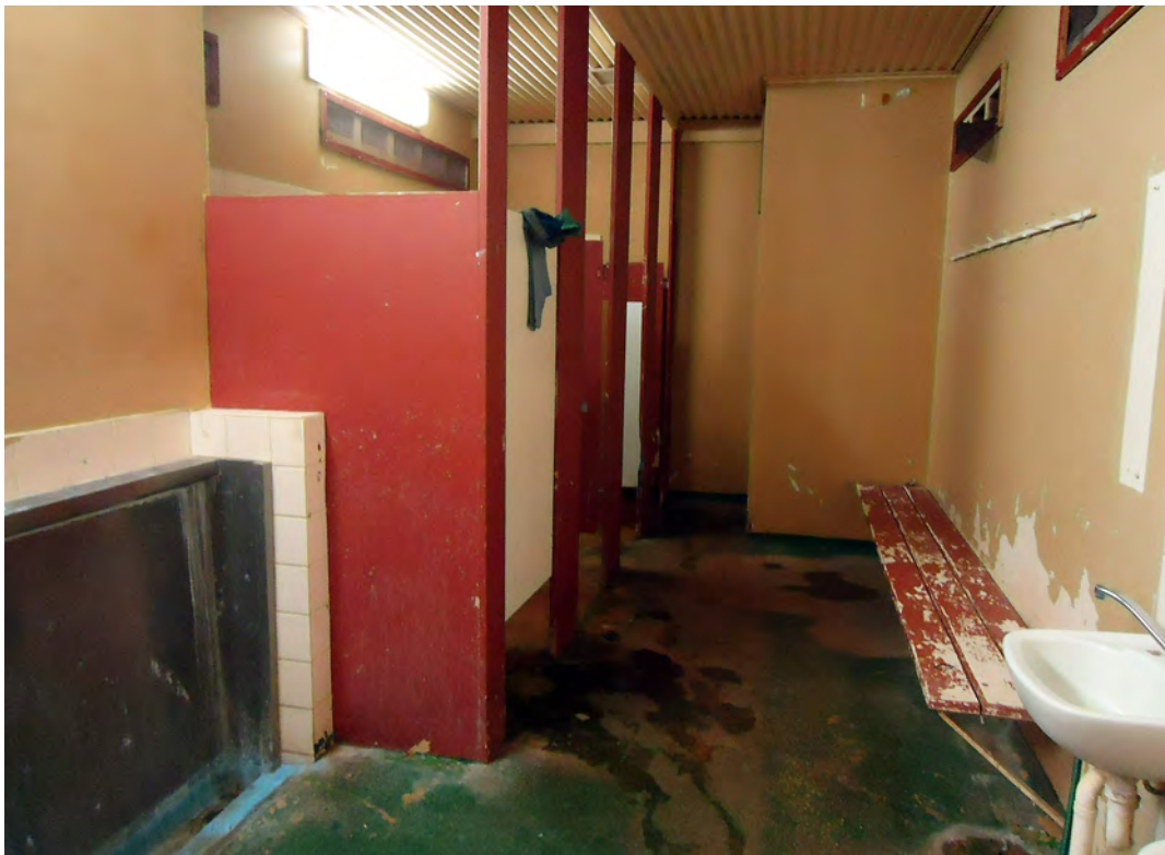
Figure 2: The communal ablutions in the male residential areas were in a state of disrepair.