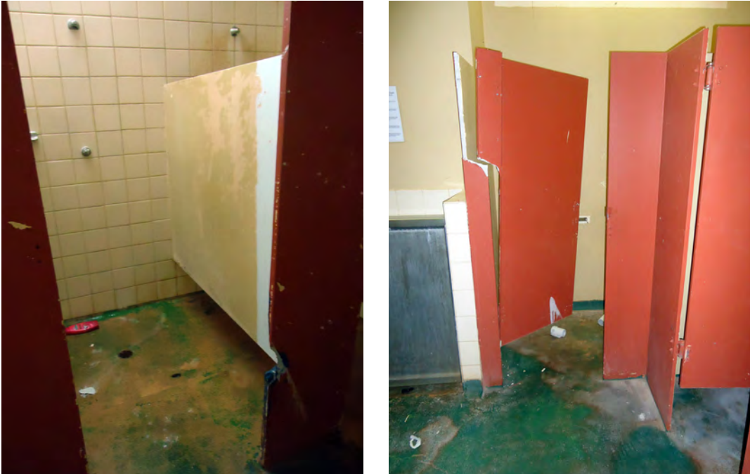
Figures 3, 4: The communal ablutions in the male residential areas were in a state of disrepair.