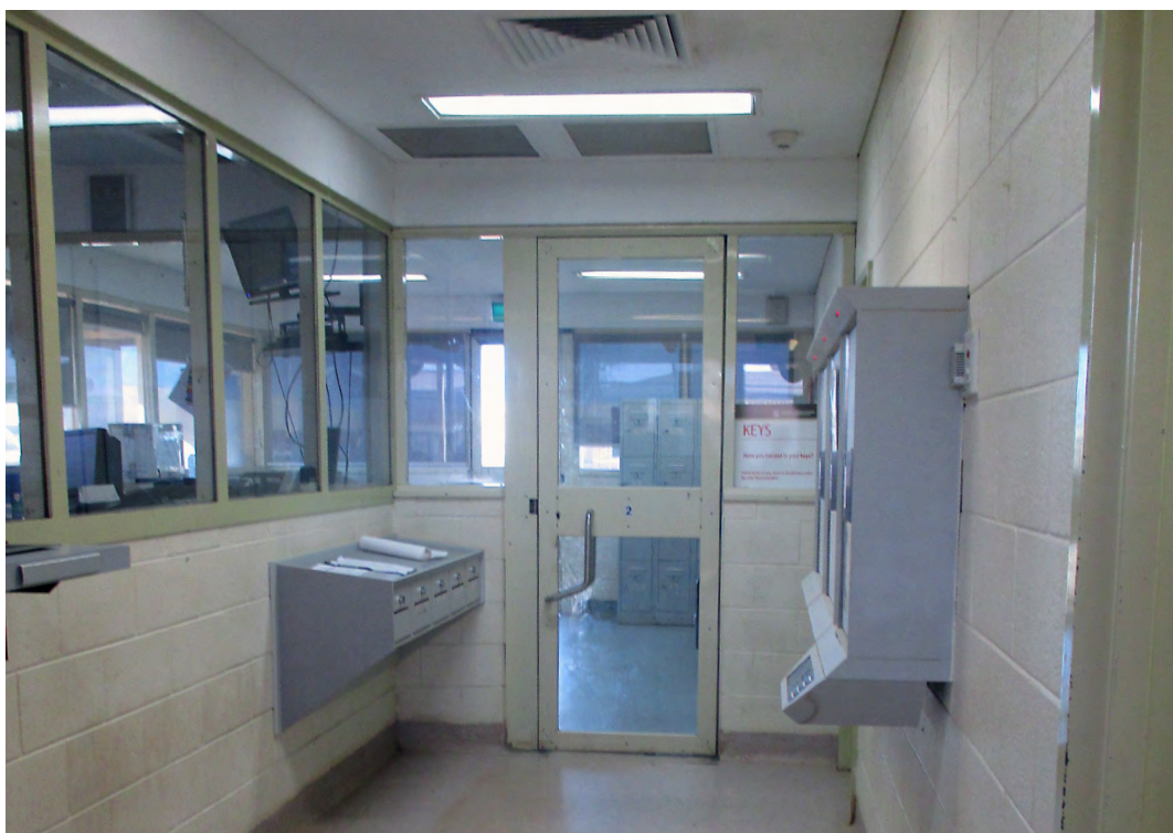
Figure 16: The gatehouse