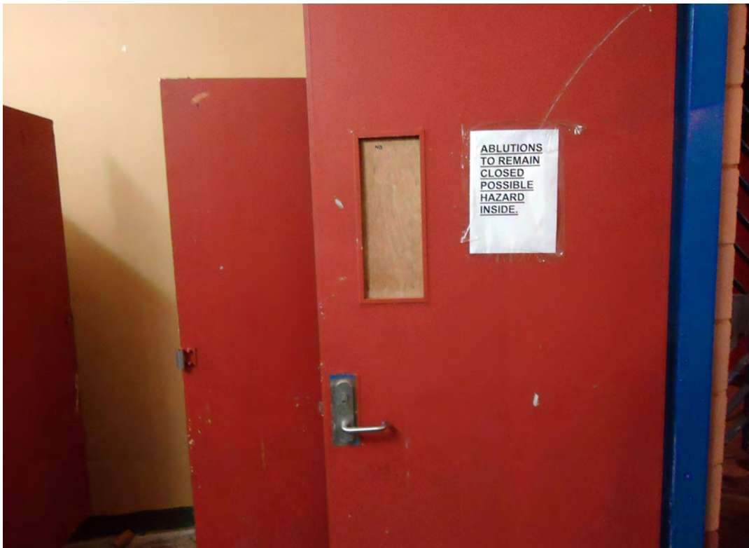
Figure 5: The communal ablutions in the male residential areas were in a potentially hazardous state.