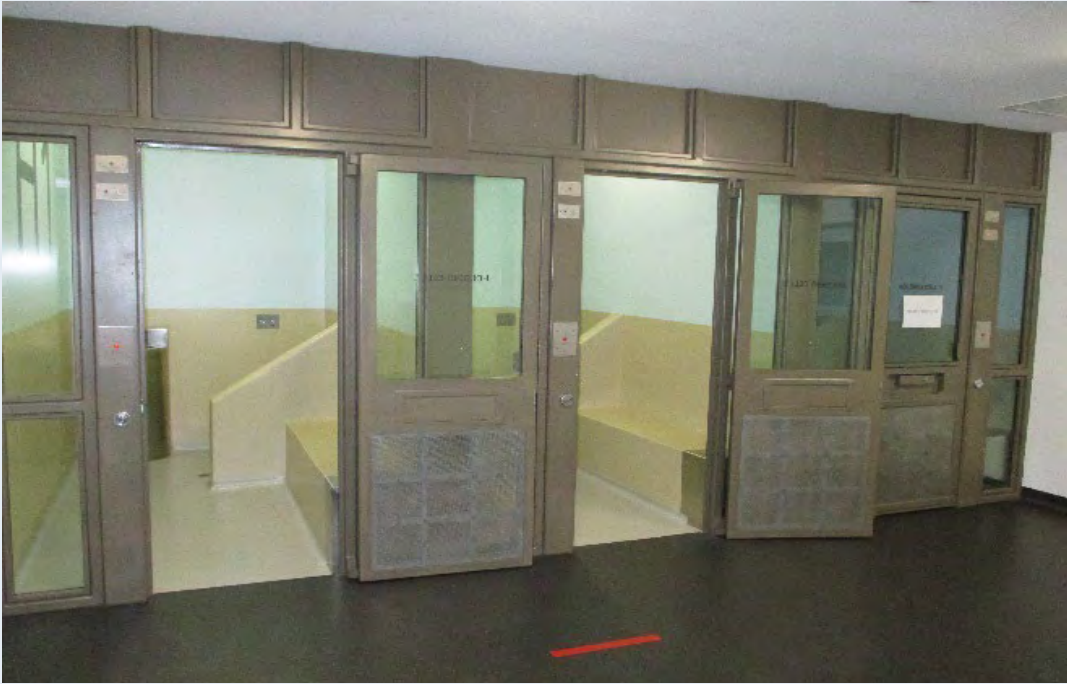
Photo 31. Carnarvon Court custody centre