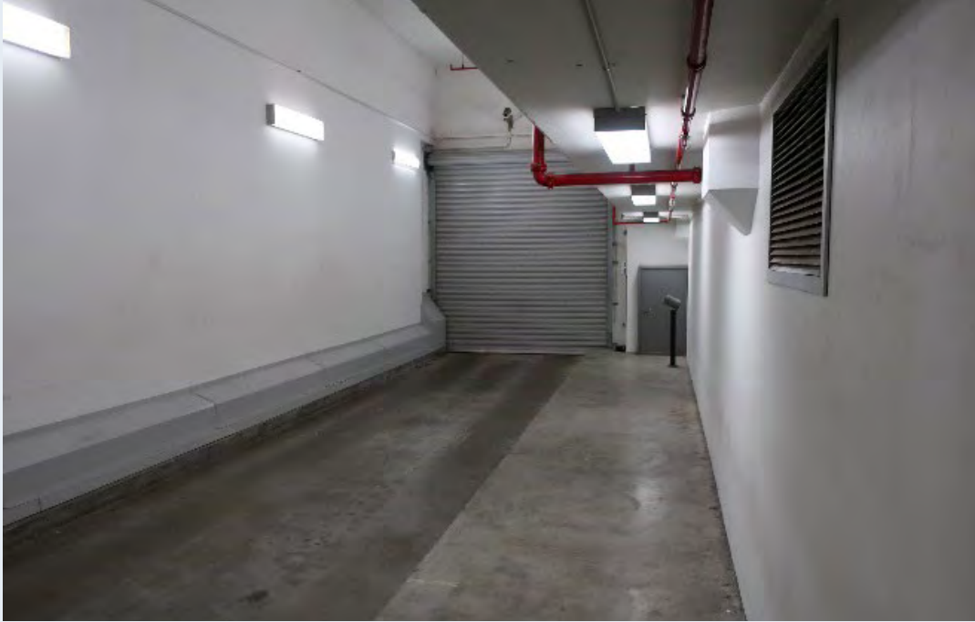
Photo 3. CLC sally port