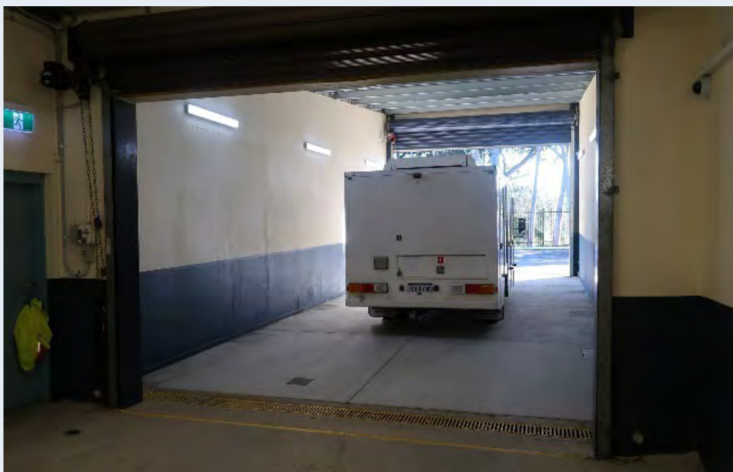
Photo 6. Armadale Court sally port