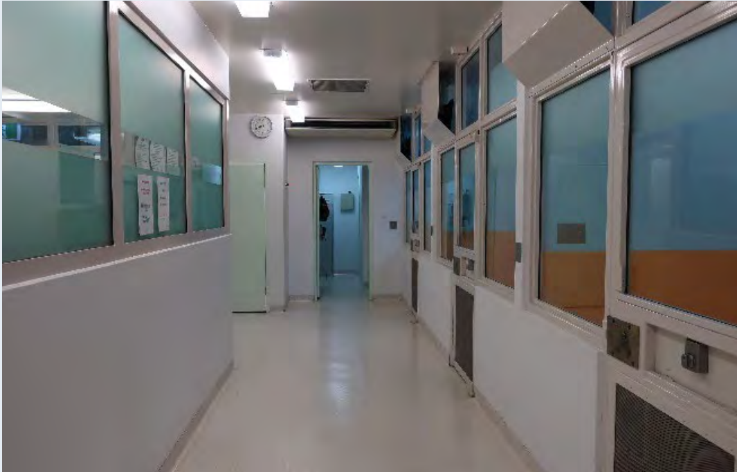
Photo 11. Mandurah Court custody centre