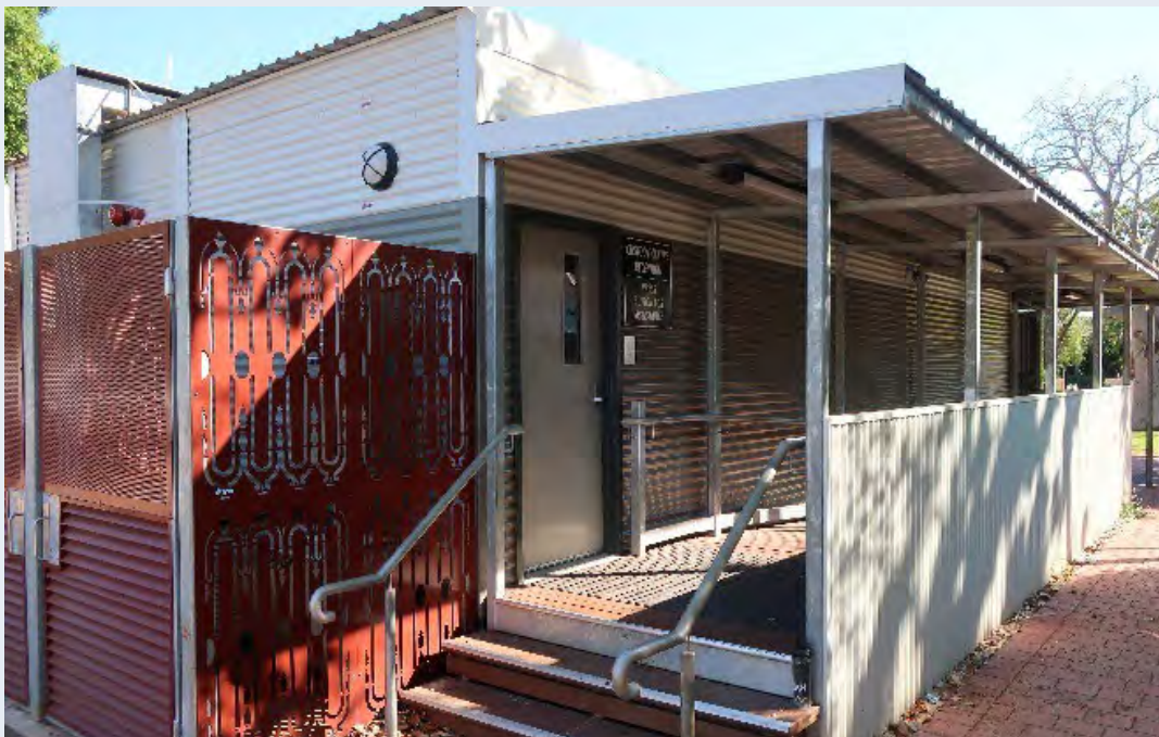
Photo 28. New Broome Court custody building