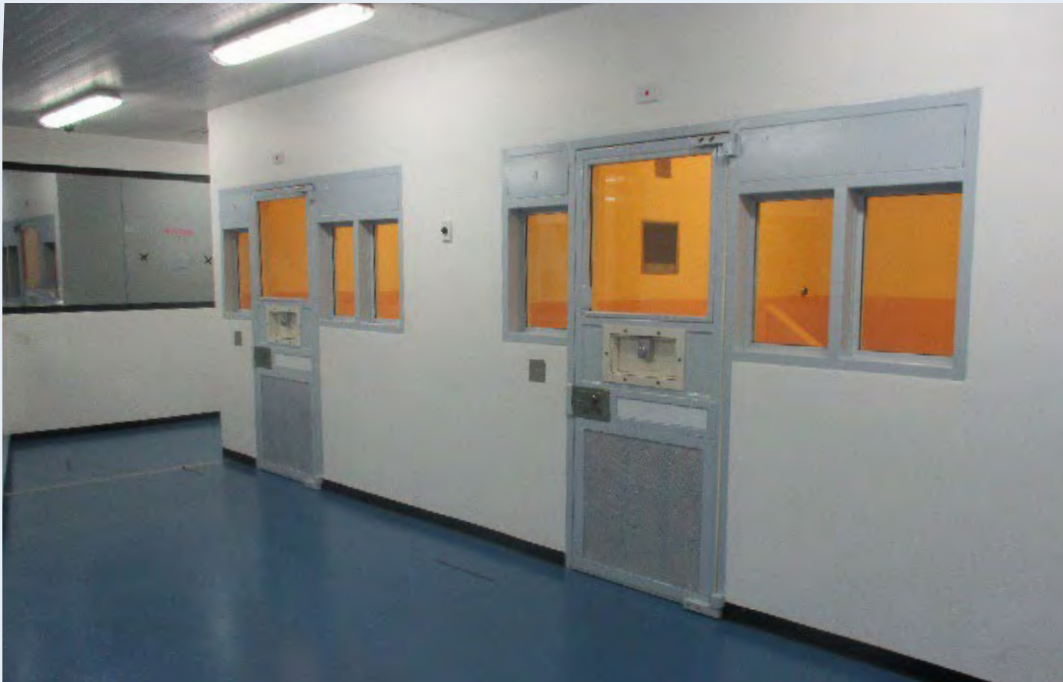
Photo 19. Rockingham Court custody centre