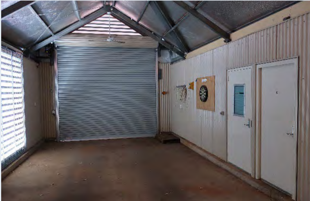
Photo 27. Broome Court sally port