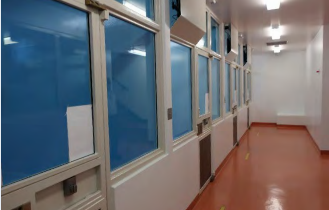
Photo 13. Midland Court custody centre