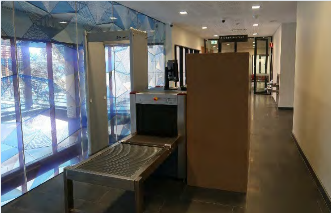
Photo 15. Northbridge bag scan