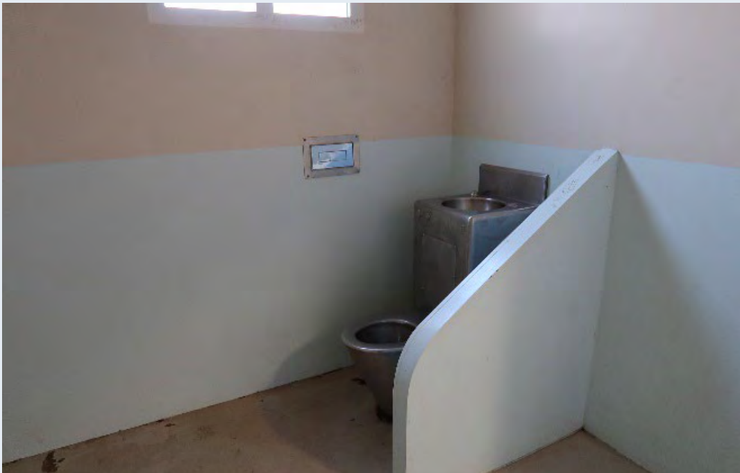
Photo 40. South Hedland holding cell