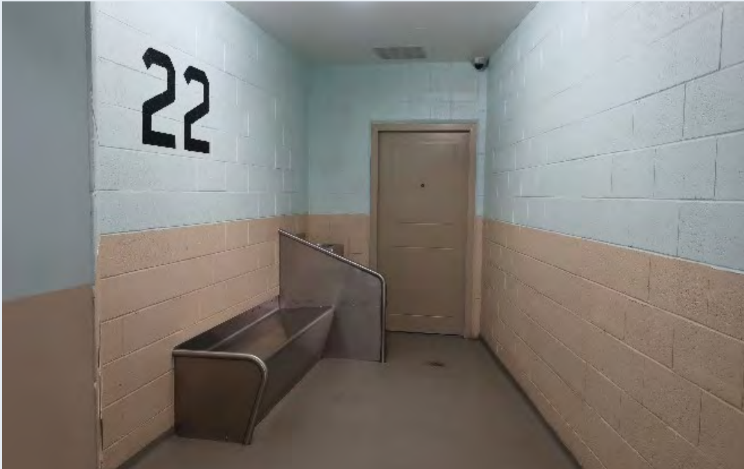
Photo 2. DCB holding cell

The DCB court custody centre showed good design, sound construction and had excellent security systems. Holding cells 1 to 15 were for general use. Holding cells 16 to 22 were for females or PICs requiring protection. Those seven cells had two doors, so PICs could be moved discreetly. There were no padded cells.