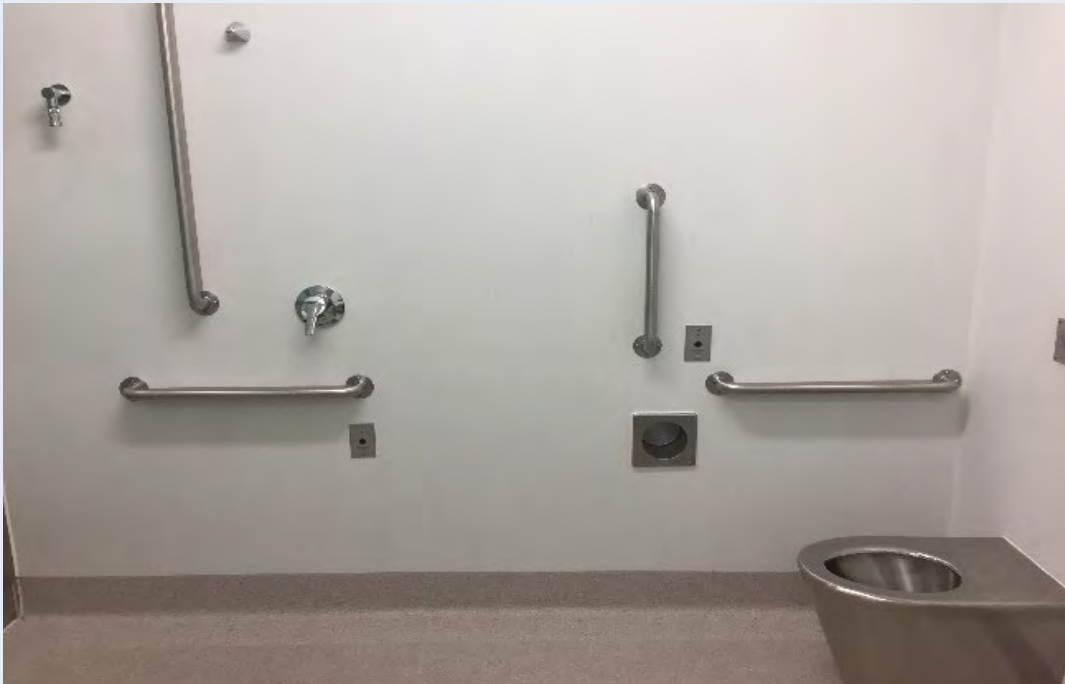
Photo 23. Fiona Stanley ambulance toilet