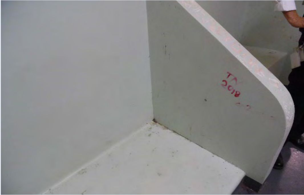
Photo 35. Kalgoorlie Court holding cell