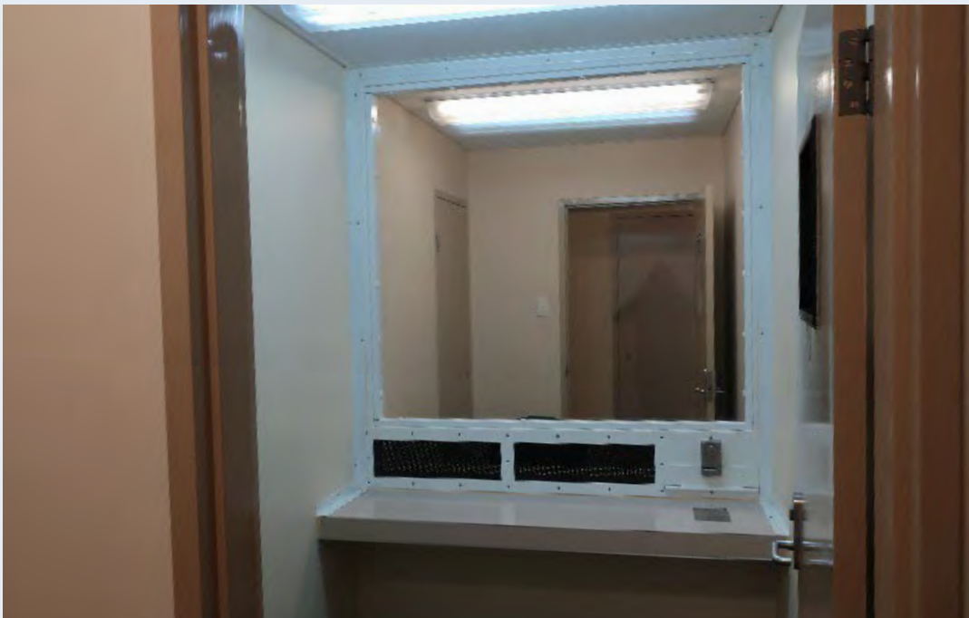
Photo 14. Midland Court interview room