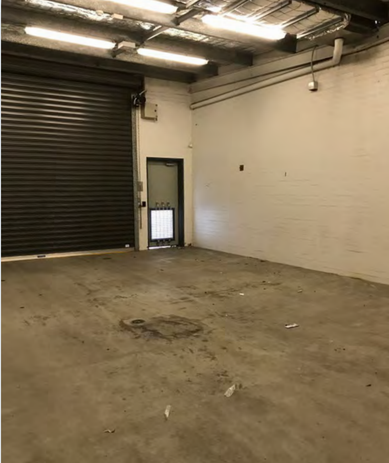
Photo 26. Albany Court sally port

court closed in the afternoon, BRS handed back control of the centre to police, who managed PICs overnight if needed.