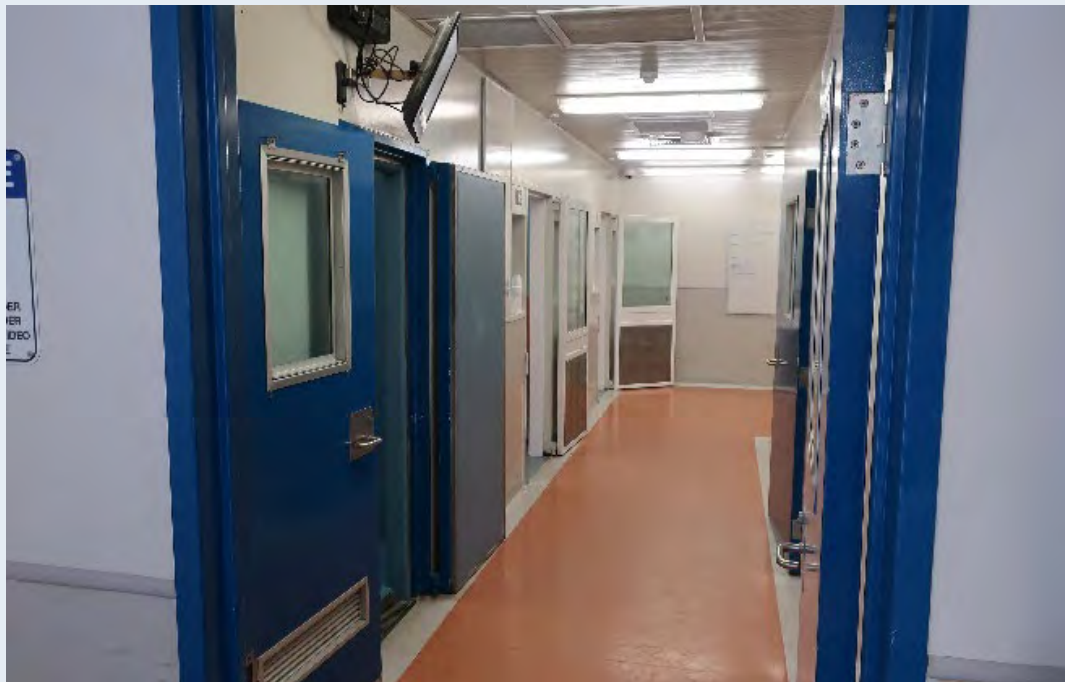
Photo 34. Geraldton Court custody centre