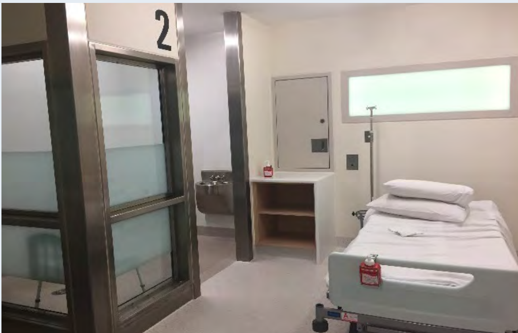
Photo 24. Fiona Stanley consulting room