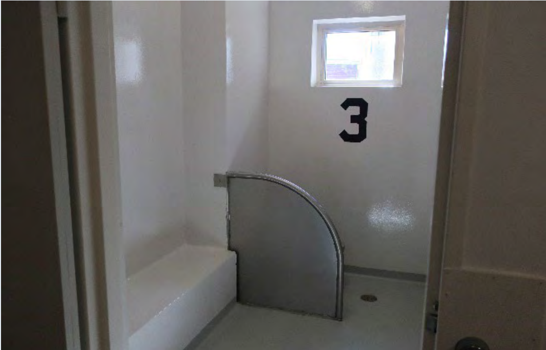
Photo 37. Kununurra Court holding cell