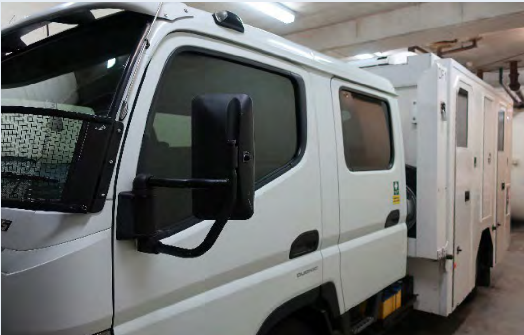
Photo 30. Vehicle in Bunbury Court sally port