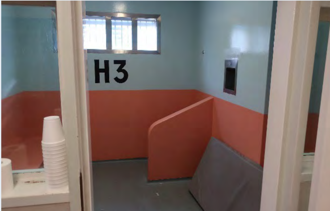
Photo 33. Geraldton Court holding cell