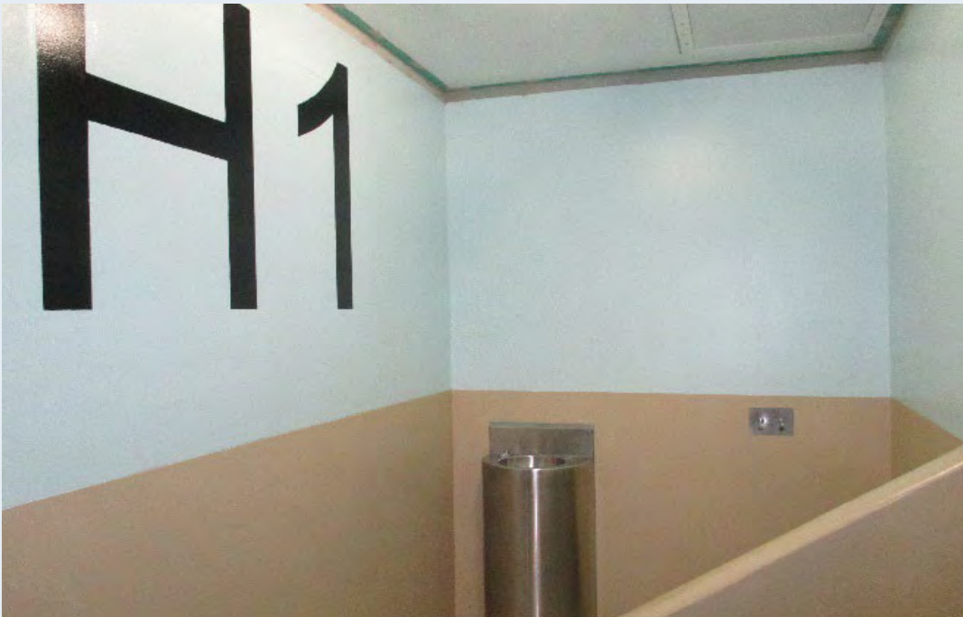
Photo 32. Carnarvon Court holding cell