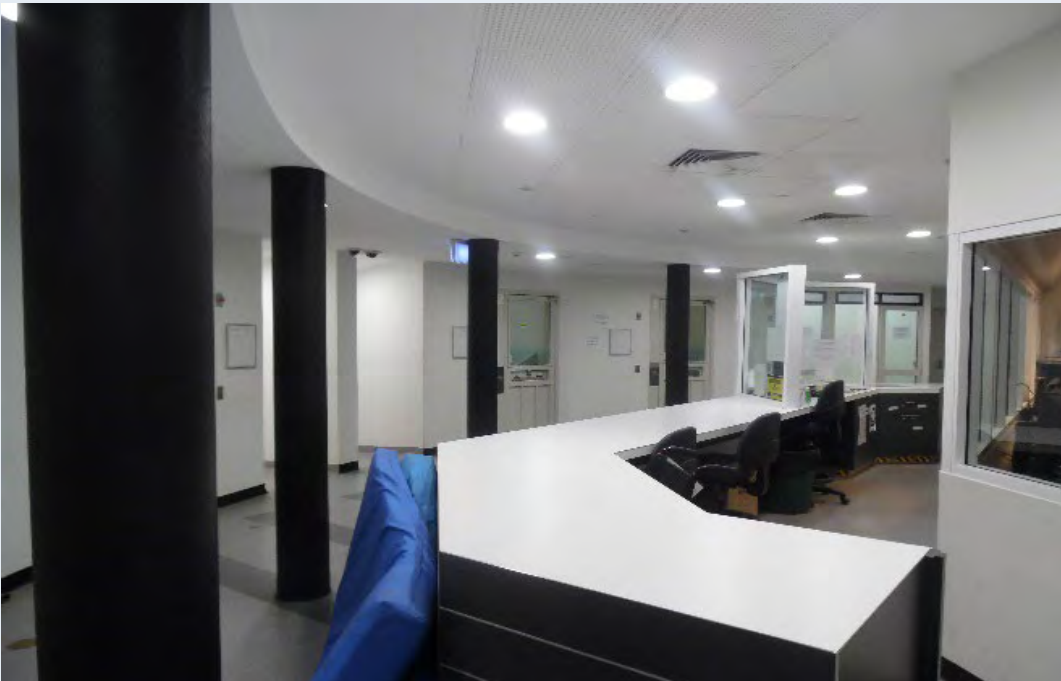
Photo 36. Kalgoorlie Court custody centre