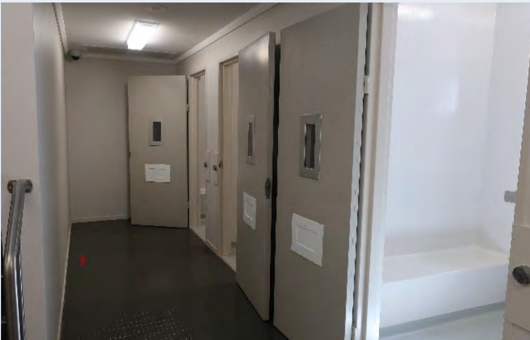
Photo 38. Kununurra Court police lock-up