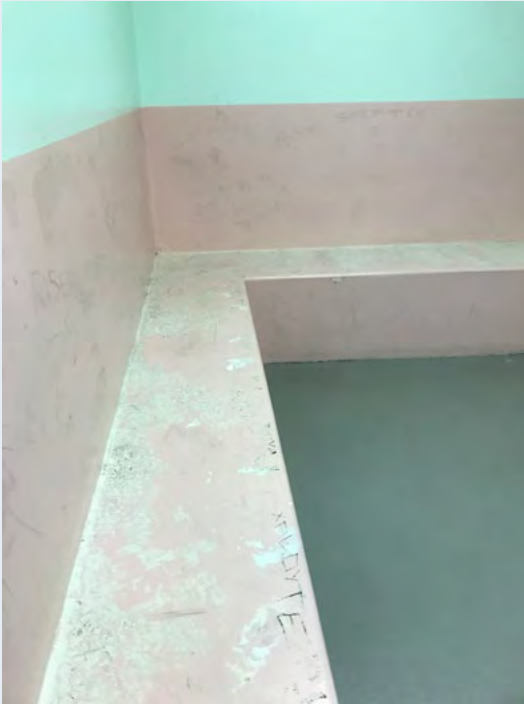
Photo 17. Perth Children's Court holding cell