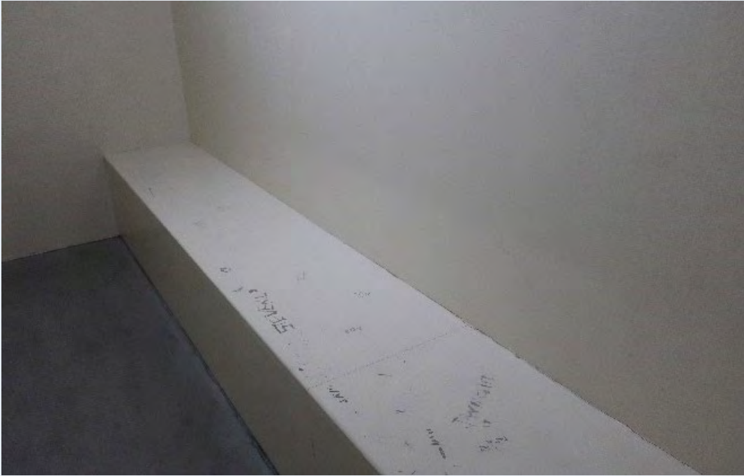
Photo 29. Bunbury Court holding cell