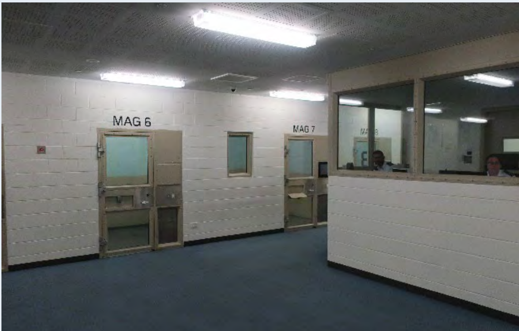
Photo 4. CLC custody centre