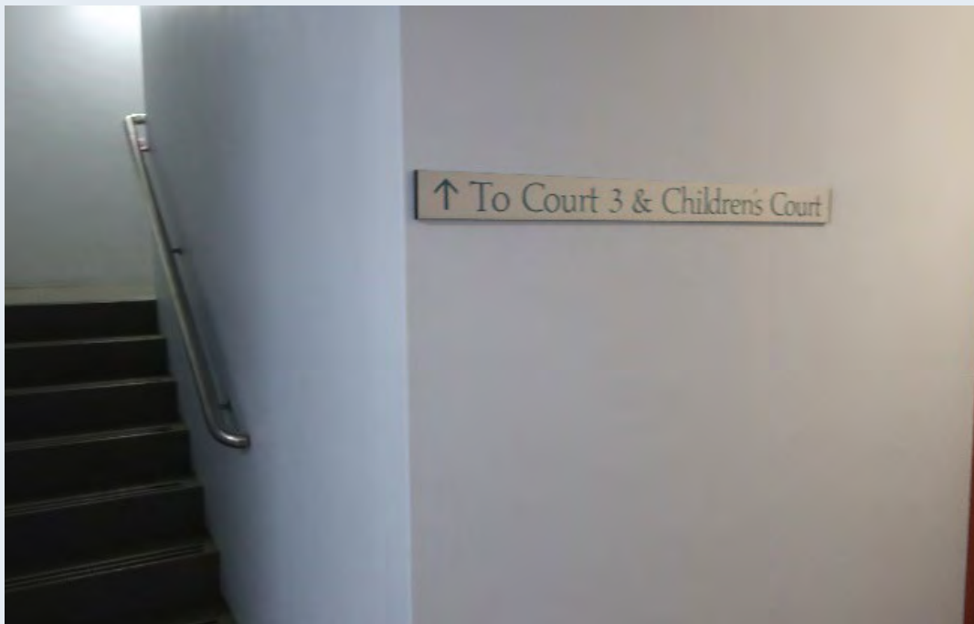
Photo 10. Joondalup Court internal stairs