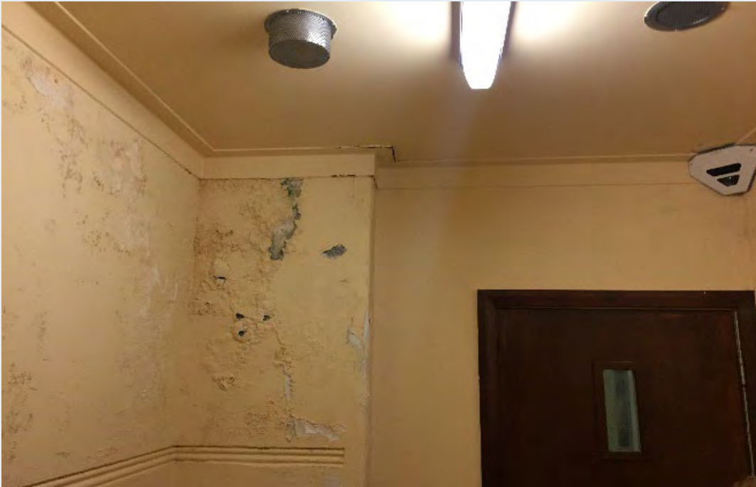
Photo 21. Supreme Court water damage