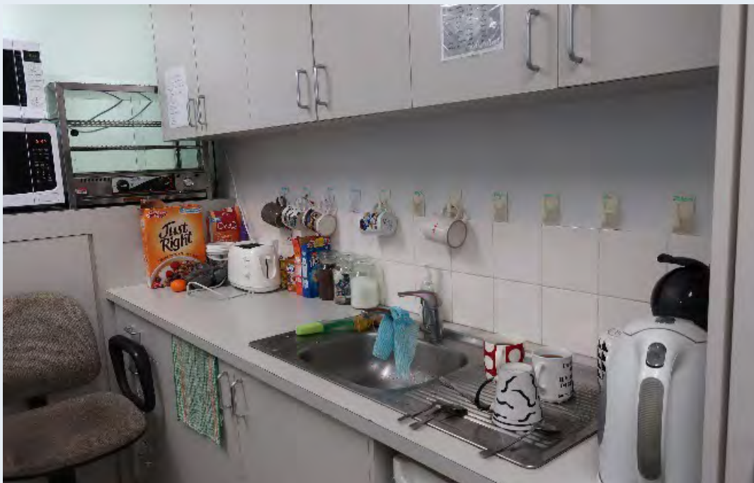
Photo 12. Mandurah Court BRS staff room