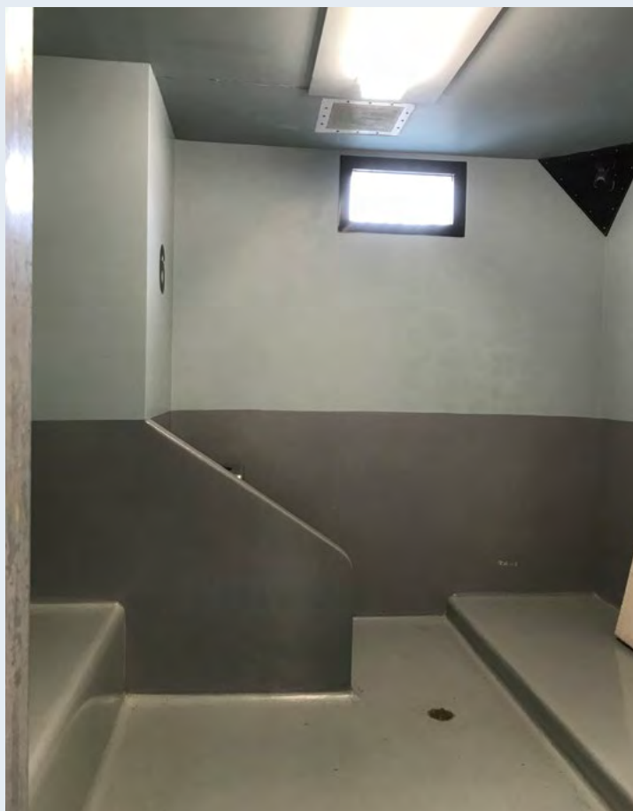
Photo 25. Albany Court holding cell