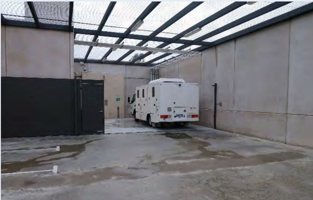
Photo 16. Northbridge sally port