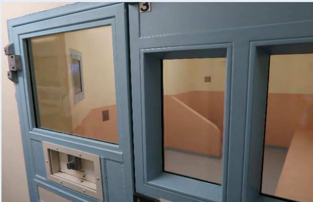
Photo 5. Armadale Court holding cell