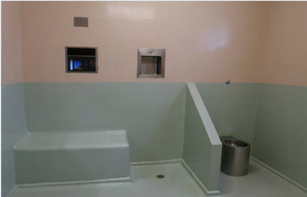
Photo 7. Fremantle Court holding cell