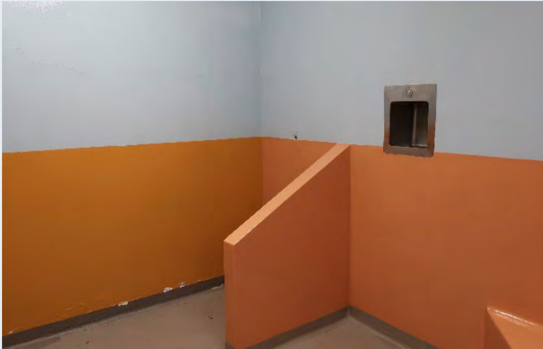
Joondalup Court holding cell