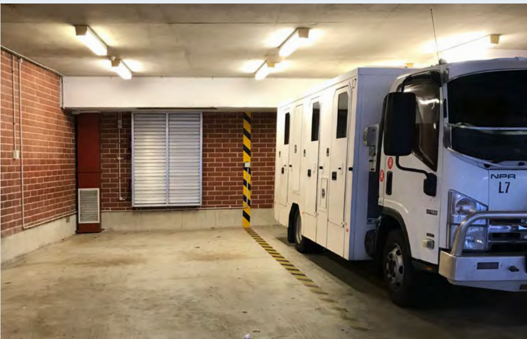
Photo 18. Perth Children's Court sally port