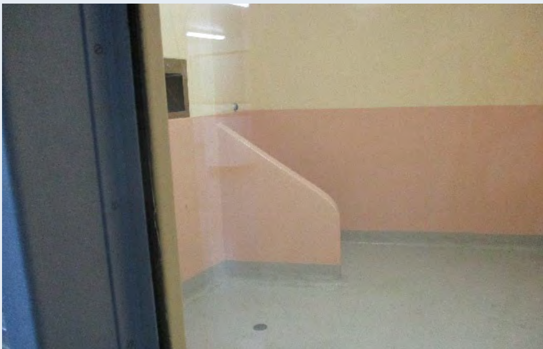
Photo 20. Rockingham Court holding cell