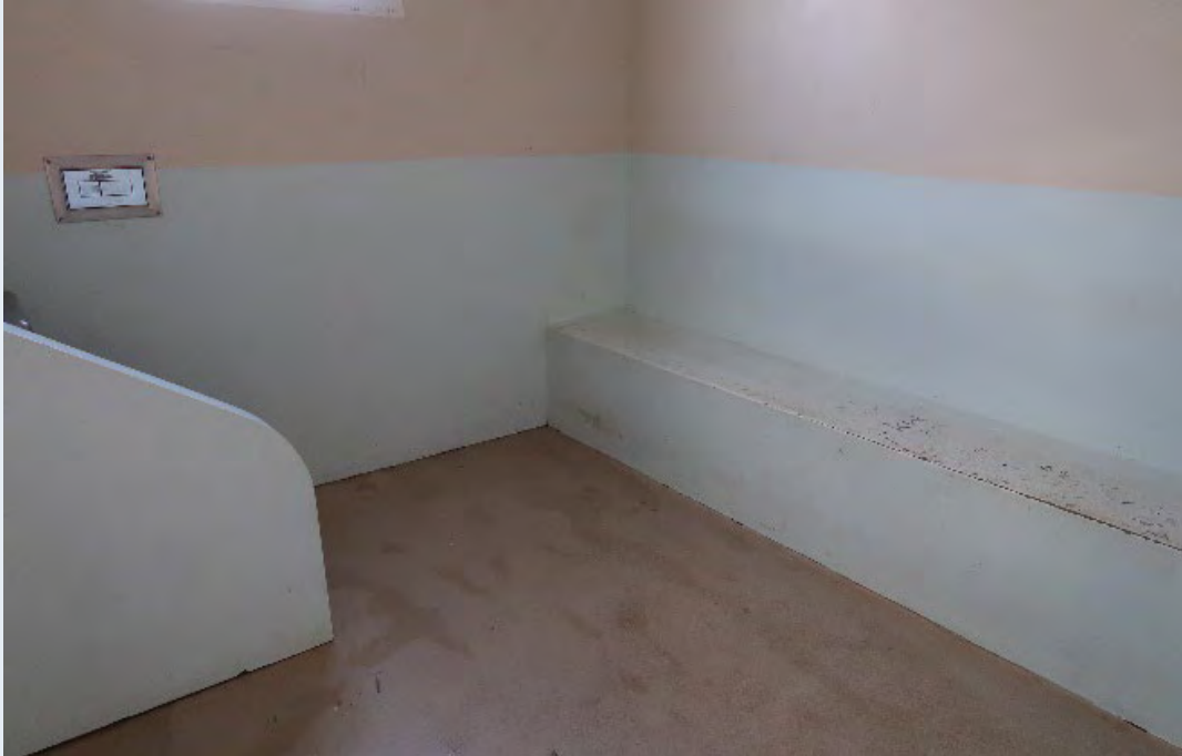
Photo 39. South Hedland holding cell