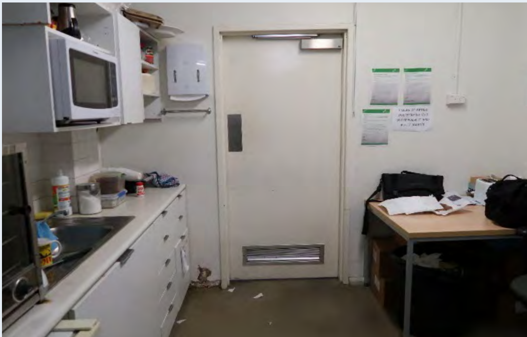
Photo 8. Fremantle Court BRS staff room