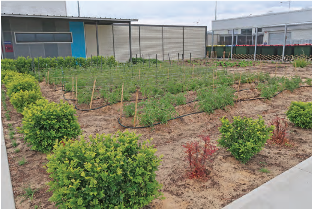
Photo 4: The market gardens that provided produce and employment for the prisoners

We heard of other initiatives that the prison was planning to introduce to boost prisoner employment. A dog washing service was planned, with cages on order. A new greenhouse and hydroponic system was also being constructed at Hakea Prison. These two initiatives are positive and when implemented should boost meaningful employment opportunities for the women.