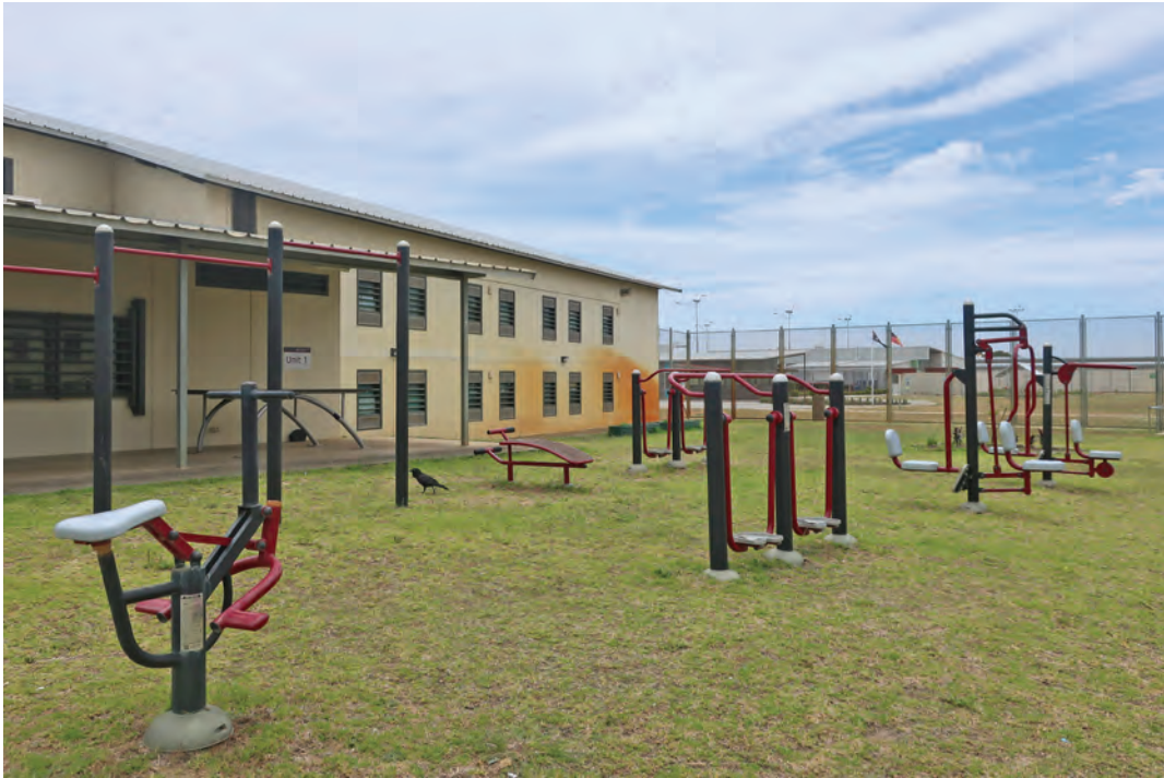
Photo 3: The exercise equipment between the two accommodation units

Every business unit that we met with during the inspection was impacted in some way due to the lack of infrastructure. In November 2020, the prison submitted a business case to head office for additional infrastructure funding. The business case proposed and quoted for the purchase and installation of two portable program buildings with additional office space. While this would help to reduce the pressure and to provide more services and activity for the women, it was only a short-term solution to Melaleuca's infrastructure crisis. The prison was not expecting a response to this business case until the Department determined funding for the 2021-22 financial year. The lack of infrastructure needs to be prioritised and funding allocated to Melaleuca as a matter of urgency.