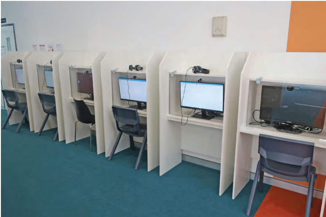
Photo 11: The new E-Visit terminals that were set up as a response to COVID-19 visit restrictions

Prison visits around the state ceased in April 2020 when COVID-19 restrictions were introduced. The Department was quick to introduce e-visits as a safe alternative. Melaleuca had seven e-visit terminals that provided an important link for women to stay in contact with their family and friends during the pandemic. The terminals also provided an opportunity for prisoners who would not normally receive visits to access this service.