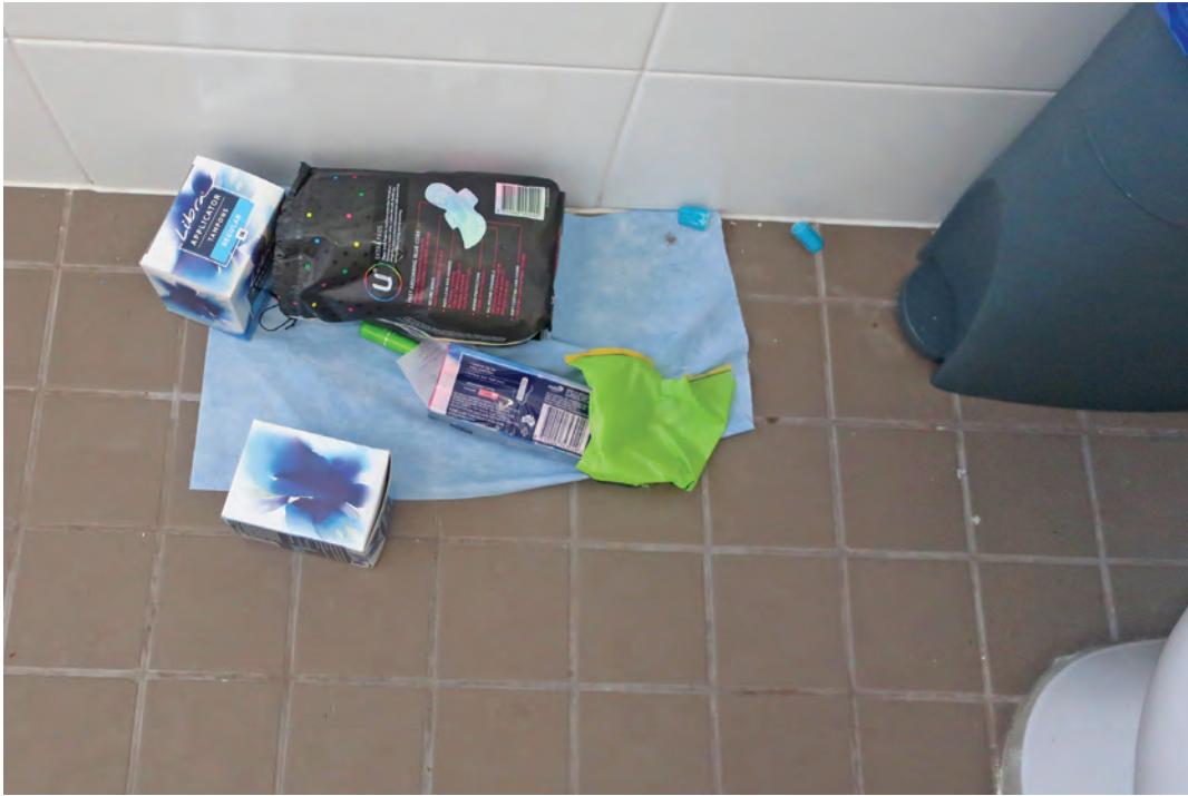
Photo 6: Sanitary products were being stored on the floor of the communal bathroom

It is the responsibility of all of those who live and work in this environment to ensure that basic levels of hygiene are achieved and maintained. Officers should monitor hygiene and intervene in respectful and helpful ways when standards start to slip.