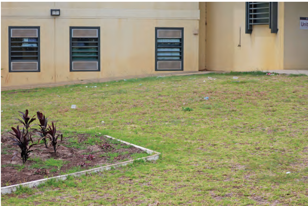
Photo 5: Litter scattered around the grounds that remained there for the entire inspection

There was litter scattered around the prison grounds that we observed for the entire inspection. We were surprised by this, particularly given the high prisoner unemployment rate and the number of women employed as cleaners.