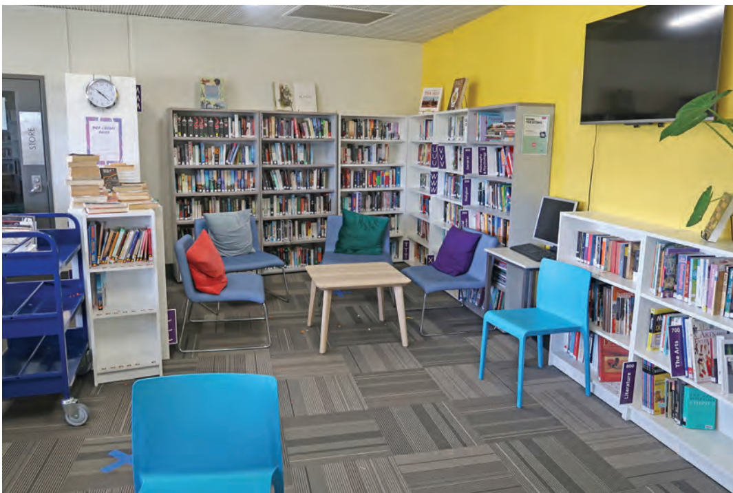
Photo 1: One of the program rooms that was converted into the library

One of the program rooms had been converted into a library. It was only accessible for women to borrow books or to review legislation on Tuesday, Thursday mornings and all day Sunday. At other times, the library was used for other activities including prisoner orientation, yoga, theatre group, wool group, active parenting classes and ukulele classes. This restricted access to the library was completely inadequate, particularly for remand prisoners who needed regular access to legal resources. Prisoners were also clearly unsatisfied with access to the library with 76 per cent of respondents rating access to the library as poor.